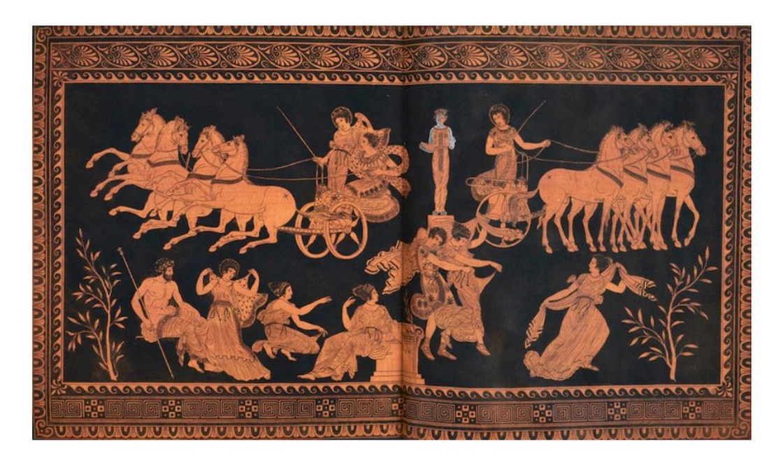
Figure 4 Engraving of the upper scene of the Meidias hydria . After d'Hancarville, Collection , pl. 130 (no. 3).