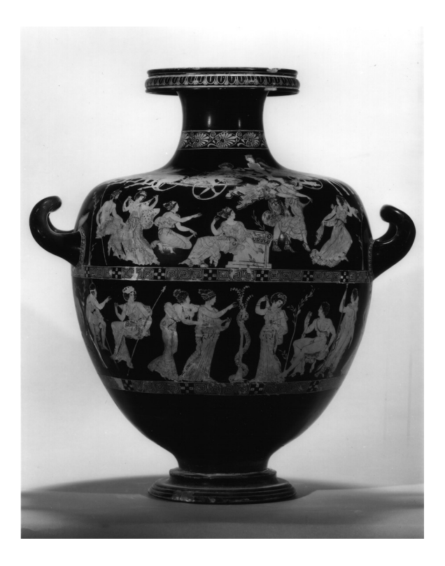
Figure 2 The Meidias Painter, Meidias hydria : Attic red-figure hydria, signed by Meidias, ca. 420 BC. London: British Museum 1772,0320.30.+ (E224).

Three vases, marked with Greek writing, are contained in the Mastrilli collection at Naples, which were made known, from the first time, by the Canon Mazzocchi, badly drawn, and worse engraved; but they appeared afterwards more correctly drawn at the same time with the Hamilton Vases. Another vase, with the inscription KAAAIKAES KAAOS, 'The Beautiful Kallicles' is contained in the same collection; there is, moreover, to be seen there a cup of terracotta, with Greek letters on it. But the most ancient writing of all is on the above-mentioned vase belonging to Mr. Hamilton; and in the following chapter I shall make mention anew of these, as well as of other pieces marked with Greek writing. Now, as not a single one of these works with Etruscan writing on it has hitherto been discovered, it follows of course that the letters, no longer to be distinguished, on two beautiful vases in the collection of Signor Mengs at Rome, are not Etruscan, but Greek: one of them I have published in my Ancient Monuments. 76