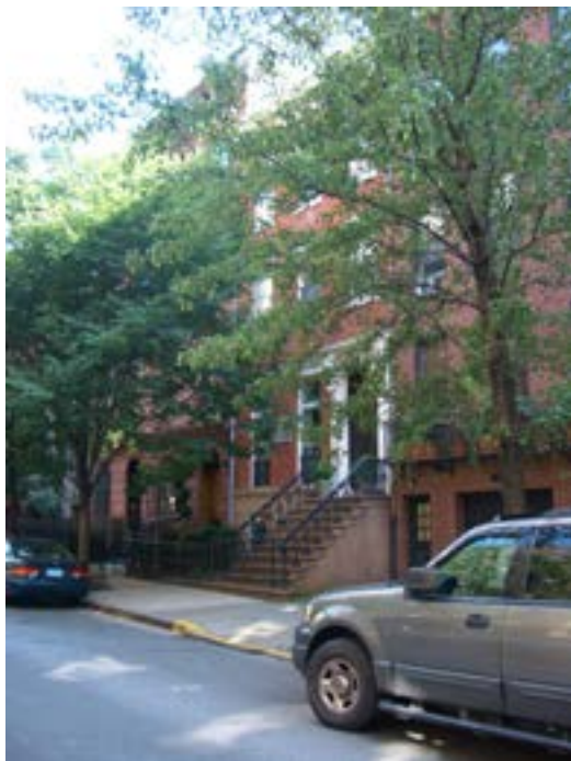
Early location of Something Else Press. New York, 2009.