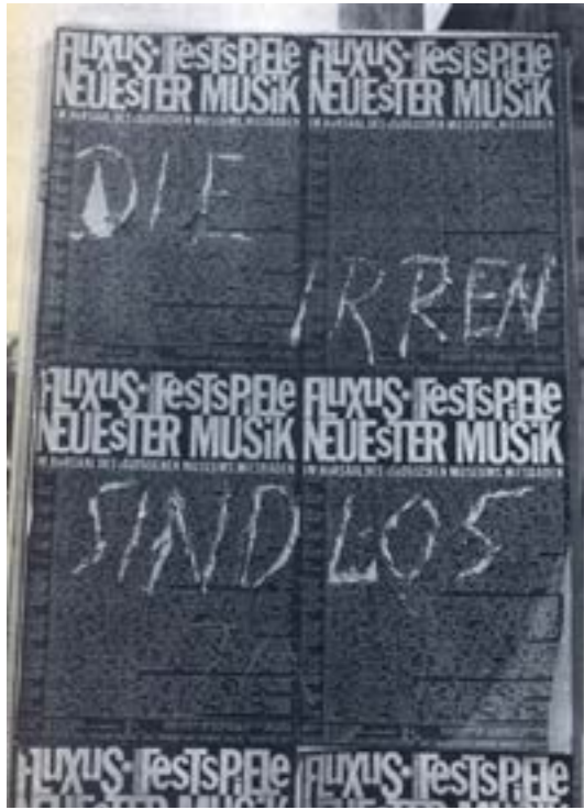
Poster, Wiesbaden Festival of New Music, Scribbles, 1962.

critique. The conventional notion of a closed, presentable, image-like performance is subverted. “Backstage” affairs are laid bare, thereby dismantling the aura of a work and of the idea of the authentic, spontaneous, and ingenious artist-as-subject.