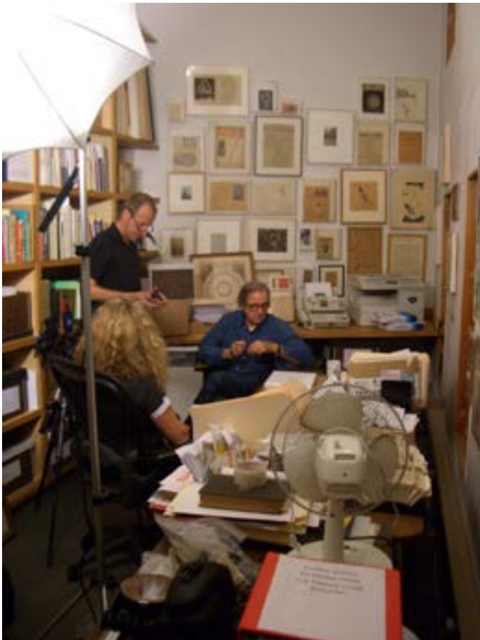
Jon Hendricks. New York, 2009.