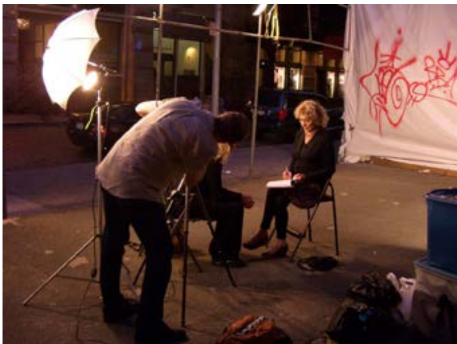
Carolee Schneemann. New York, 2009.