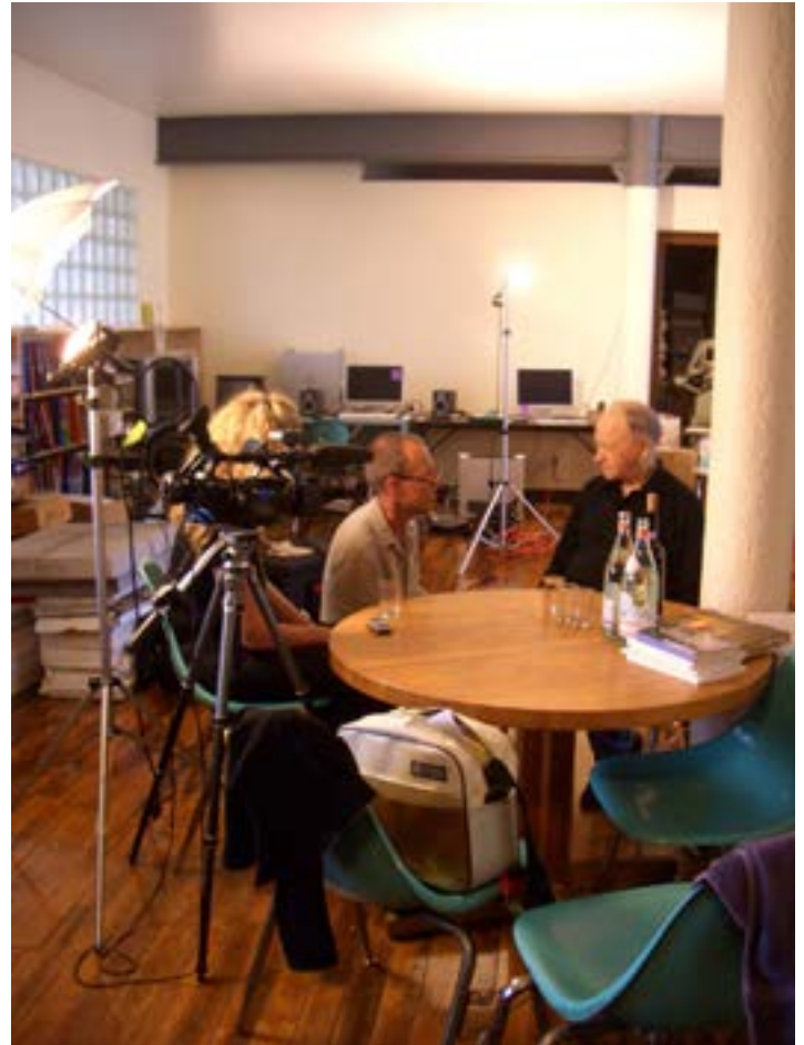
In the studio of Jonas Mekas. New York, 2009.