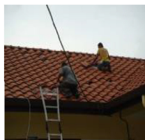
"The height and narrow space between the roof and ceiling caused the electrician to work from top of the roof for wiring purpose. That's dangerous." (P5)