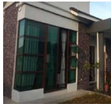
"The sliding door is not covered with shade, at the front of the house. The rainwater easily enters the house." (P2)