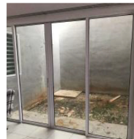
"Unusable space that maybe designed to encourage planting. But I locked the space to avoid cockroaches from the inspection chamber into the house. The smell of the gas is also bad." (P6)