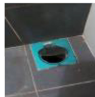
The floor trap cover is bent and cannot be closed, leaving a large gap (P1)