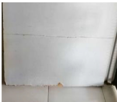
"...the rainwater penetrates through windows - two rooms at the back affected... the roof eave is insufficient; the rainwater hits the main door directly. So, the timber door got damaged." (P3)

Participant P3 was concerned about security, after robbers broke through the neighbour's door. Likewise, P6 indicate security concern, because the quality of sliding lock sets of the main doors were poor and to break-in the house is easy (Plate 1c). On average, all houses had two entrance doors, two sliding doors leading to the living room, a sliding/folding door in the dining area and a backyard door. A common opinion among participants was that the increased number of the doors had also reduced the health and safety level, despite that when opened, the doors allow ventilation. House grilles (or iron bars) were thus added for safety reason at the owner's expense. All participants were found to have grilles installed. In addition, the participants highlighted that when doors are opened, their houses were easily accessible by animals, rodent and insects as well as dust, sand, dried leaves and rainwater when blown by the wind. This is made worse for P6 by the inclusion of a green space that could not be used due to the presence of an inspection chamber that released sewage gas and unpleasant odours while also allowing cockroaches to enter the house (Plate 1d). Most of the