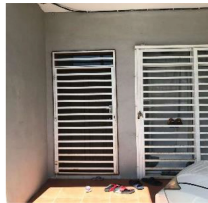
"The main door is beside the sliding door. So, if I accidentally left my keys in the house, I could just jerk the sliding door's lockset and open the main door easily. So, it shows lack of safety for the design". (P6)