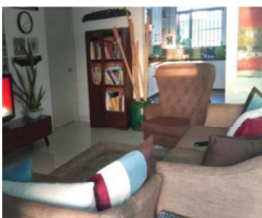
"As there is no shade, heat directly enters the house causing the front area become hot." (P2)