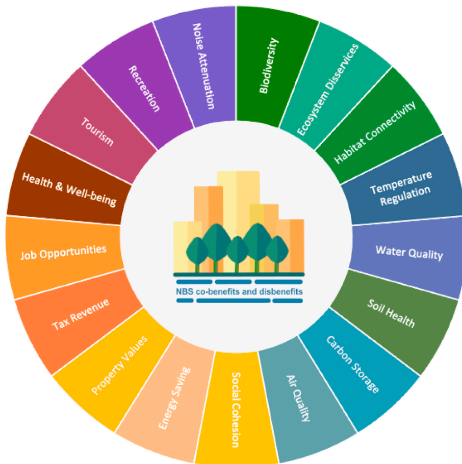
Fig. 1. Commonly reported NBS co-benefits and disbenefits.