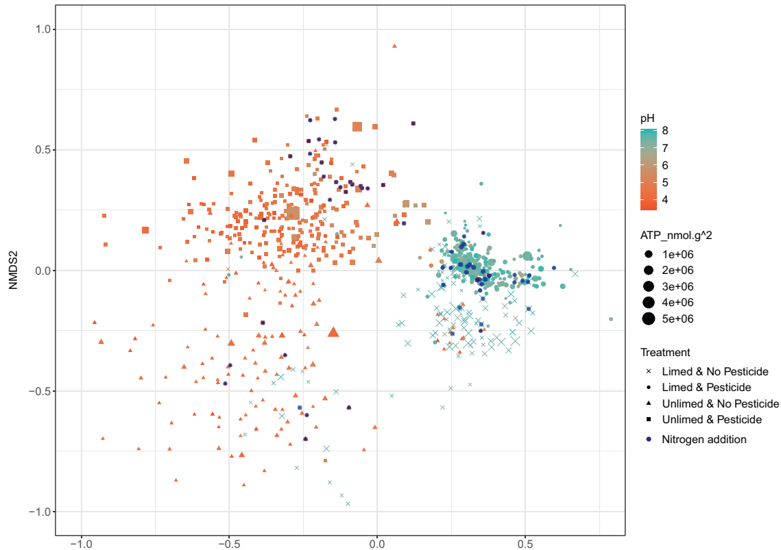
FIGURE 1 Non-metric multidimensional scaling analysis (Bray–Curtis dissimilarity; stress = 0.14) of soil bacterial communities within Nash’s field, illustrating the impact of liming and pesticide treatments on community structure. Unlimed treatments (filled triangles and filled squares) showed greater variance compared to limed treatments (filled circles and crosses); homogeneity of multivariate dispersions 0.28 and 0.18, respectively. Colour of the points represent pH (red/orange are acidic and blue/green are neutral) and size of the points represents the metabolic activity (ATP in \text{nmol g}^{-2} ; squared for illustration) of the soil microbial community. Pesticide application (insecticide or molluscicide) is illustrated by filled circles and filled squares and showed a decrease in variance (Table SI 2.2). Overlaid navy blue points represent soils with no nutrient additions for reference

applied at the beginning of the experiment but discontinued after 1994, had no overall effect at the top of the hierarchy, but its effect could still be observed in limed (neutral) soils when no pesticides were added (SI 2). These findings, therefore, suggest that the impacts of future anthropogenic change can only be interpreted in light of interactions among multiple stressors. Chemical amendments (liming, pesticides and herbicides) appeared to directly impact bacterial communities, while plant-specific treatments (rabbit grazing) were less significant for determining bacterial community composition (SI 2). The response to inorganic fertilizers was pH-dependent, which also modified the impact of pesticide on soil activity and bacterial community composition (SI 2). For example, we would not have observed any significant impact of nutrients on bacterial community structure if the experiment was conducted only at neutral pH (Figure 1: overlaid red points). The interactions that we observed among the treatments pose a challenge for the search for microbial indicators of soil health and demonstrate the need for experiments that simultaneously manipulate several factors.