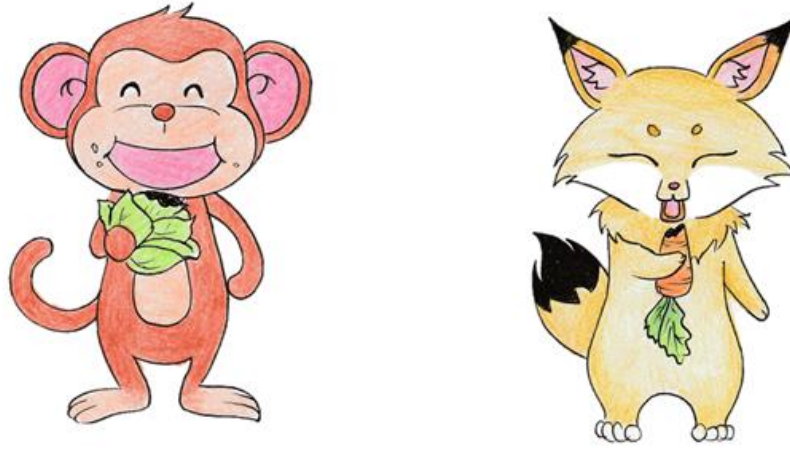
Figure 1 top. Example of the picture stimuli for the experiment

1 2 3 4 5 6 7 8 9 10 11 12 13 14 15 16 17 18 19 20 21 22 23 24 25 26 27 28 29 30 31 32 33 34 35 36 37 38 39 40 41 42 43 44 45 46 47 48 49 50 51 52 53 54 55 56 57 58 59 60 61 62 63 64 65