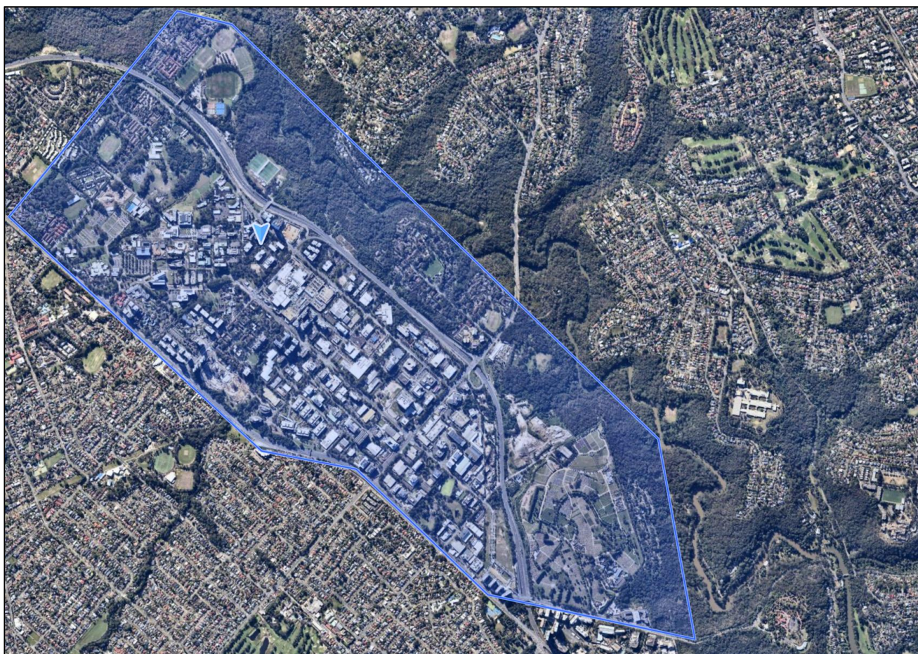
Figure 2. Location of Macquarie Park Innovation District.

The following three leading Australian innovation districts are selected for the study: Macquarie Park Innovation District (MPID) in Sydney, Monash Technology Precinct (MTP) in Melbourne, and Kelvin Grove Urban Village (KGUV) in Brisbane. From these three cases, MPID is recognized as the largest and most mature innovation district in Australia, MTP is seen as the leading non-central business district hub for employment, economic growth, and innovation in Victoria [45,46], and KGUV is one of the best known ‘new urbanism’ projects in Australia formed as a mixed-use master planned community [47]. Figures 2–4 show the location of the case study innovation districts—licensed Nearmap software was used to create these figures.