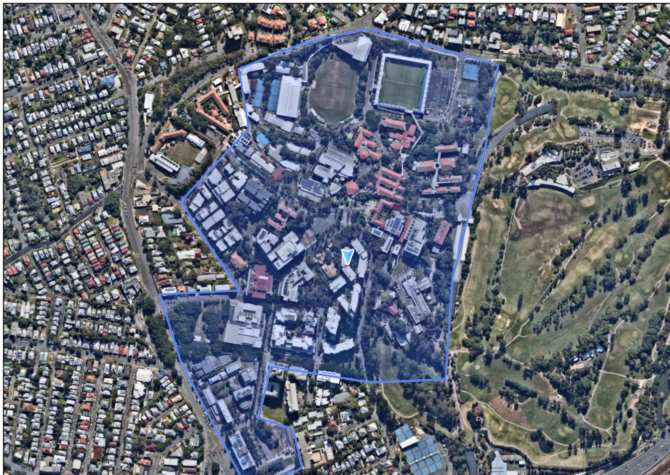
Figure 4. Location of Kelvin Grove Urban Village.

Johnson & Johnson. In contrast, KGUV only has around 50 businesses employing approximately 4000 people. Besides its anchors and the Queensland Academy of Creative Industries, the other existing businesses are mainly in the health care (e.g., medical centers), retail, and food service (e.g., restaurants) sectors.