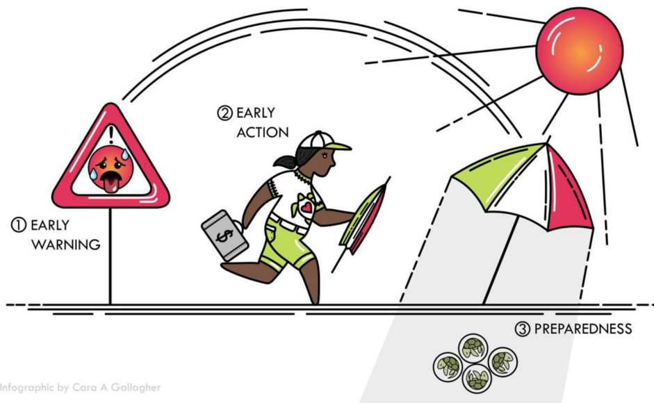
FIGURE 2 A theoretical example of forecast-based action applied to sea turtle conservation. Early warnings of temperatures exceeding thermal tolerance limits of developing sea turtle embryos trigger deployment of resources and personnel to protect nests. Canopies are installed to shade nests and prevent overheating or eggs are excavated and artificially incubated until hatching. Graphic by Cara Gallagher, based on Red Cross media.