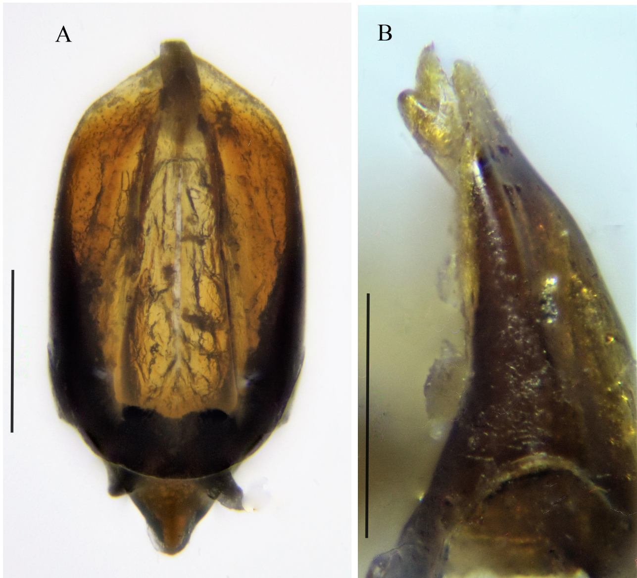
FIGURE 2. Orphilus aegeanus holotype A: aedeagus dorsal surface, B: median lobe lateral aspect illustrating shape of tip of lobe, position of ‘tooth’ on ventral surface of lobe, and lack of setae on ventral surface of paramere tips, scale bars = 0.2 mm

Acknowledgements: we are very grateful to an anonymous referee for very constructive comments on how to improve the original submission, and to the subject editor for the efficient processing of the manuscript.