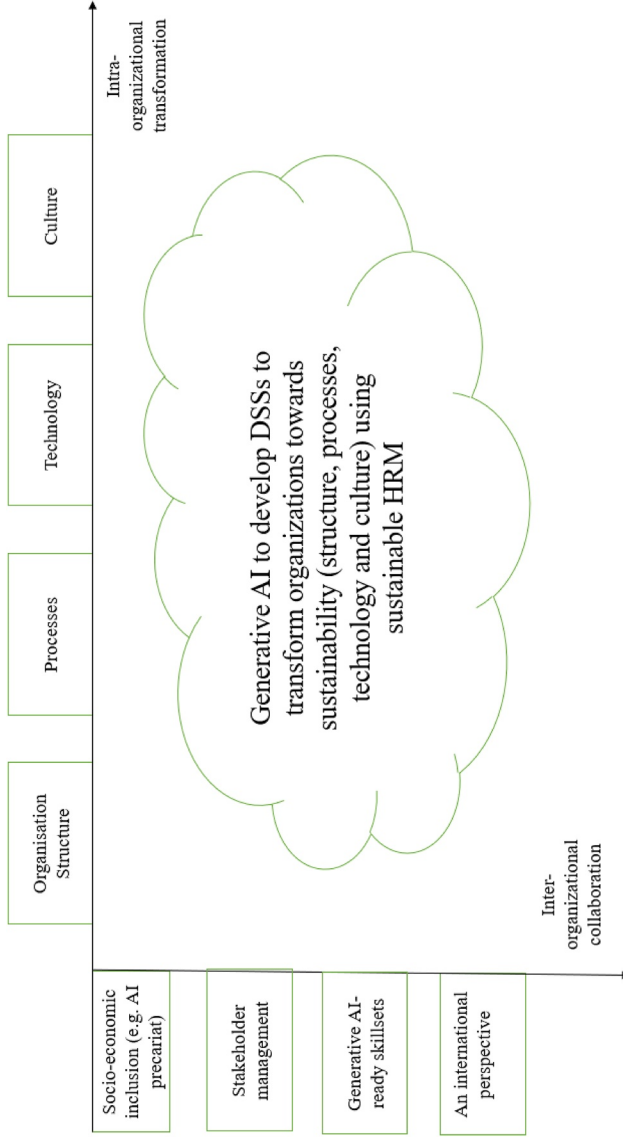
FIGURE 6 Research scope of generative AI to embed sustainability within organizations through sustainable HRM. [Colour figure can be viewed at wileyonlinelibrary.com ]