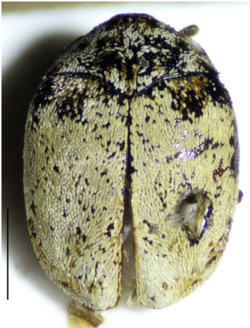
FIGURE 3. Anthrenus isabellinus pale example. Scale bar = 1 mm.