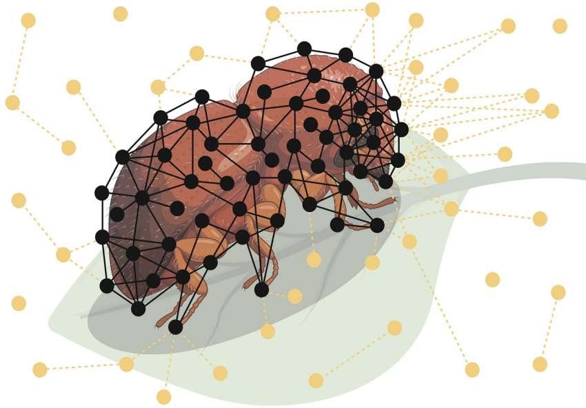
Fig. 1 A simplified representation of the body organization of a typical animal (beetles comprise 25% of all known animal species, Zhang et al. 2018). Animals are likely more integrated internally than externally, possibly having more channels of communication between elements of their bodies than between these elements and the environment. Besides, the most important channels of communication between animals and the world are concentrated in the head, where we find the

brain, eyes, antennae, mouth, nose, ears, etc., or the extremities of their bodies. Black dots and lines represent elements of the animal body with their respective connections. Yellow dots and lines, elements and variables of the environment and their respective connections. Solid lines represent relations constitutive of the cognitive systems. Dashed lines represent relations between or with elements in the environment. Created with BioRender.com . (Color figure online)