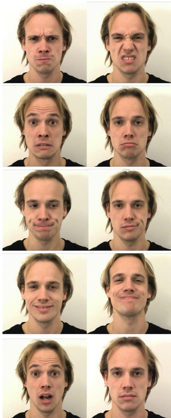
Figure 1. Example facial expressions for each of the nine emotion categories (from the top left corner per row: anger, disgust, fear, sadness, embarrassment, contempt, happiness, pride, surprise) and a neutral blank stare (last image bottom right corner) included in the study. The still images are the last frames of the high expression intensity video for each emotion category of the selected encoder.

in response to the emotional expression of embarrassment partially matched the characteristic embarrassment expression of mouth corners pulling outward (i.e. increased activity in the zygomaticus site) but not lips pressed (i.e. no significant change in activity in the levator site). The facial muscle activation pattern in response to the emotional expression of pride matched the characteristic pride facial expression of mouth corners pulled outward and upward, as the activity in the zygomaticus site and in the levator increased significantly.