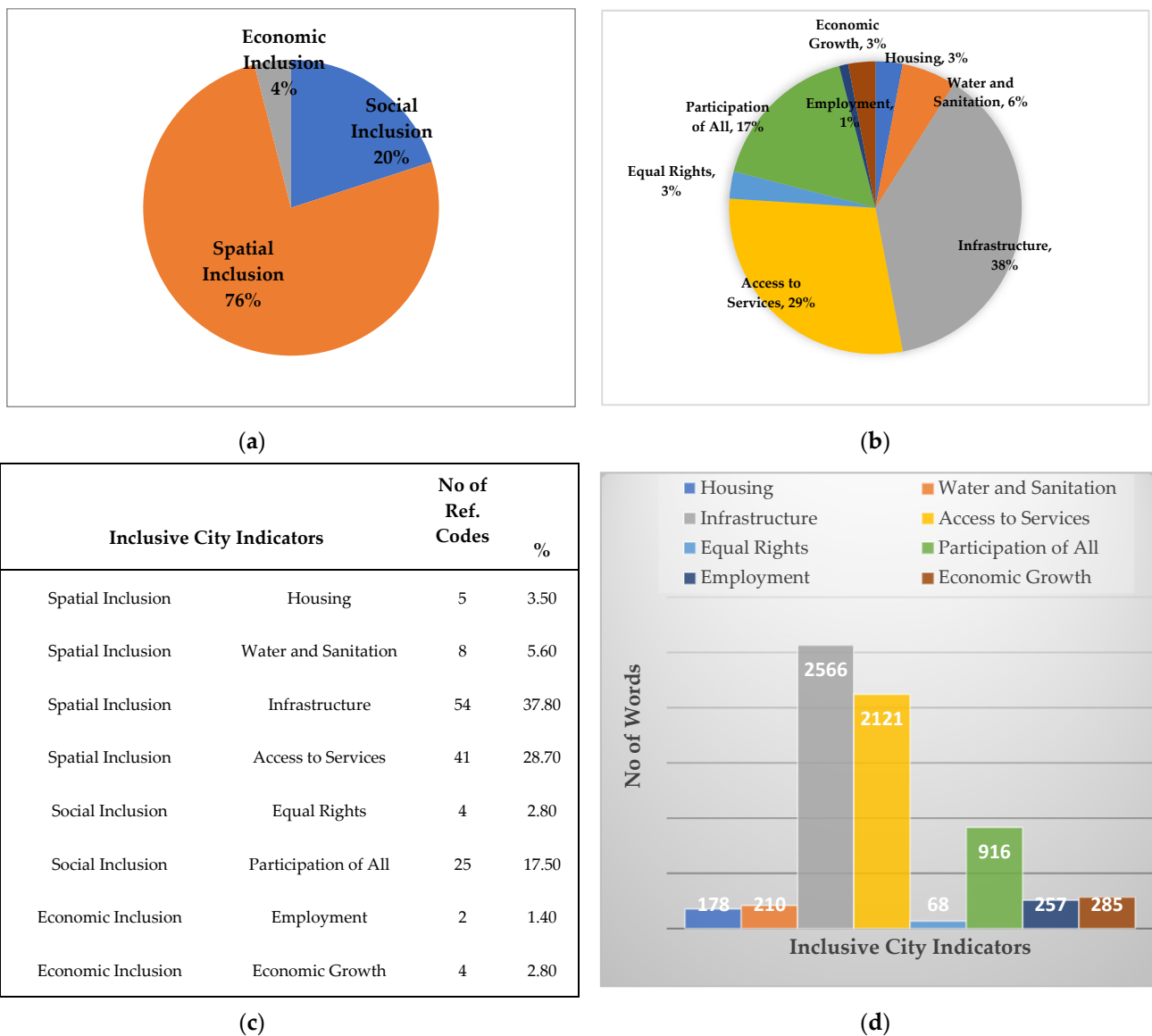
Figure 2. Content analysis of inclusive city indicators. (a) Inclusive city indicators and percentage of encoded words. (b) Breakdown of inclusive city indicators—percentage of encoded words. (c) Inclusive city indicators and number of referenced codes. (d) Inclusive city indicators and number of encoded words.