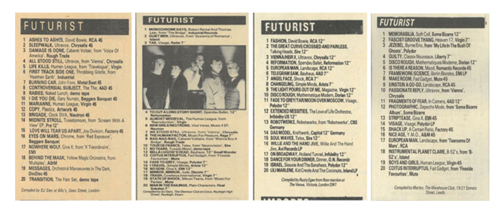
Figures 7-10. Futurist charts, Sounds, 30 August, 29 November, 13 December 1980, and 28 March 1981.