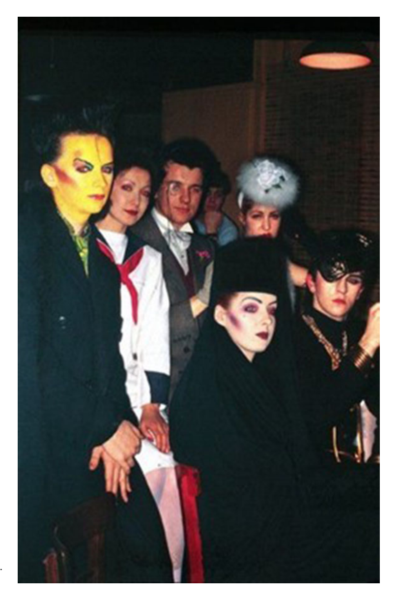
Figure 18. Blitz Kids.

romantics signaled a moment of sexual possibility, wherein genders and sexualities blurred or emerged bravely and defiantly to seek new modes of expression. <sup>134</sup> That all this was captured and accelerated by technological innovation was less the result of 1980s economic policy and more the product of new media processes developing over the preceding period, particularly with regard to digital electronics, video, synthesized sounds, printing techniques, and design practice. <sup>135</sup> What was captured, moreover, tended to relate far more to imagery and sensibilities evocative of the years preceding the 1980s. Initially, at least, new romantics suggested louche glamour not hard-nosed business; decadence not healthy efficiency; pop culture as an escape route rather than a career; street or haute couture