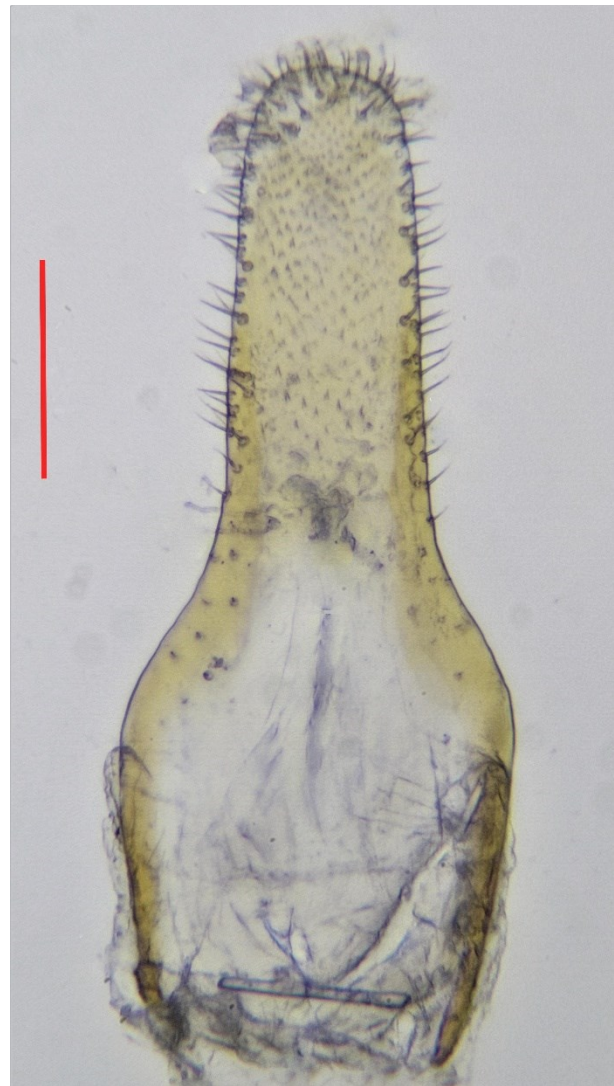
Figure 4. Sternite IX of A. flavipes flavipes . Scale bar = 100 \mu\text{m} .

LeConte (1854) passed comment on one specimen from New York, USA and described the white elytral spots as seeming “inclined to form three fasciae”. The specimens studied here did not display any such tendency. The sub-basal elytral white spots do sit within orange scales to form a fascia, but across the middle of the elytra there are two well separated white spots, one adjacent to the elytral suture and the other on the lateral margin (see figure 1). There is a substantial area of black scales separating these two white spots, which show no tendency to form a fascia. The two apical spots sit within orange scales spread throughout the apical region of the