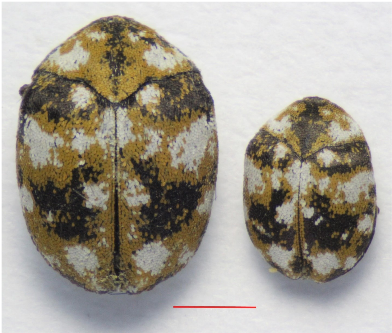
Figure 1. Dorsal surface of A. flavipes flavipes illustrating size range within the species. Left, a large female, right, a small male. Scale bar = 1 mm.

Figure 3 shows the aedeagus, Mean AE = 505 \pm 13 \mu\text{m} , CV = 2.6%. Figure 4 shows sternite IX. Mean SL = 468 \pm 16 \mu\text{m} , CV = 3.4%. There is a significant linear relationship between BL and AE (AE = 403.5 + 0.0341BL, p = 0.005 ). A 5% change in BL is associated with a 1% change in AE.