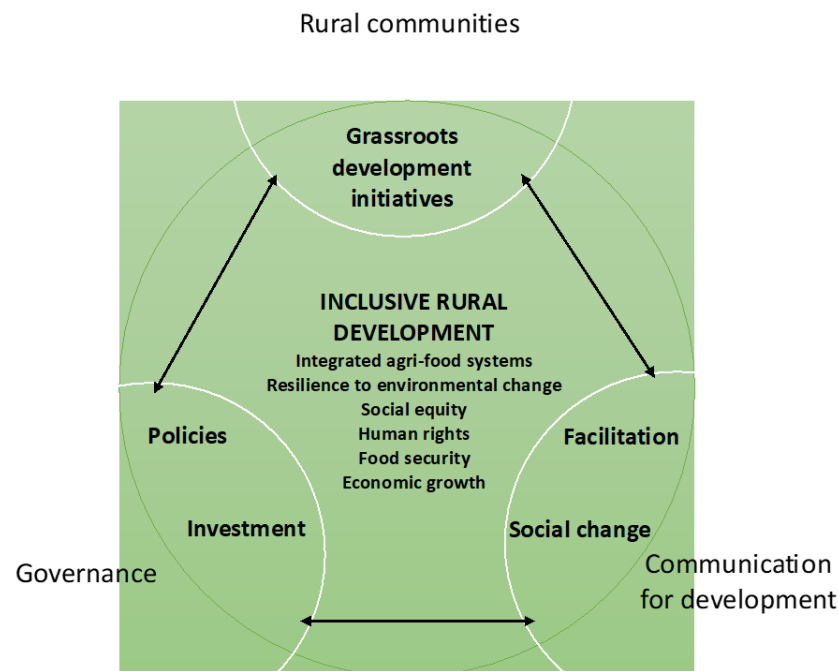
Figure 2. The integrated conceptual framework for inclusive rural development.

The main indicators of inclusive rural development include the improvement of integrated agri-food systems, resilience to environmental change, human rights, social equity, food security, and economic growth. The basis of the conceptual framework in Figure 2 was borrowed from the triple helix thesis (Etzkowitz 2003) on university–industry–government relations in innovation and the learning regional model designed by Rutten (Rutten and Boekema 2007). The main components of our design are the rural communities, governance, and communication for development.