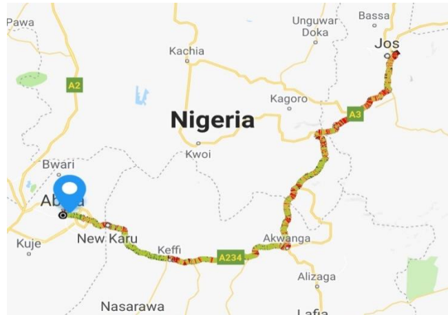
Figure 4: Screenshot of IRI measurement for road link (RoadLab Pro)

Plateau State with Capital in Jos lies to the North- East of the F.C.T. The road comprises of asphalt paved dual carriageway from Abuja, F.C.T to Keffi in Nasarawa State and paved single carriageway from Keffi to Jos, Plateau State. The road link was broken into ten (10) sections in both clockwise and counter clockwise direction.