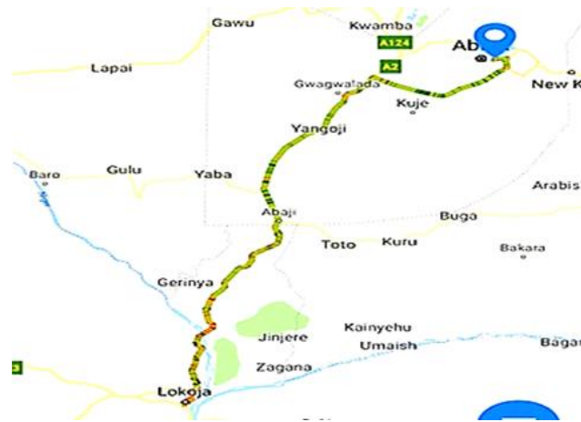
Figure 2: Screenshot of IRI measurement for road link (RoadLab Pro)

From the data collected by Roadroid, total surveyed length is 392.28km with an average speed of 88.42km/h. The estimated IRI (eIRI) 2.47; classified as satisfactory.