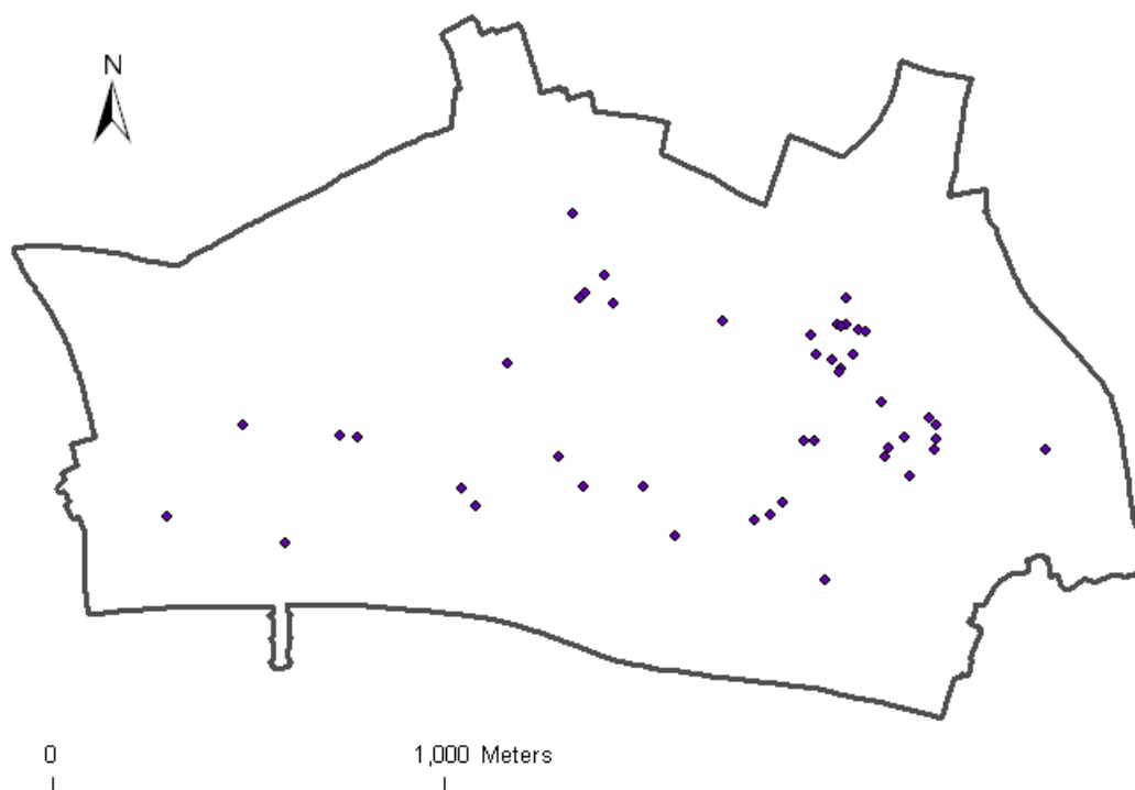
Figure 3: Location within the City of London of properties in the sample Displaying properties that produce 1 or more paired observations

Locations determined using Historic Digimap, © Crown Copyright and Landmark Information Group Limited 2007. Location co-ordinates found using Digimap Carto, © Crown Copyright/database right 2007. An Ordnance Survey/EDINA supplied service. The author is grateful for the help of Peter Byrne of the University of Reading in producing the map derived from this information.