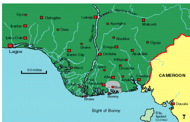
Fig. 1- Map of Southern Nigeria

The rainy season usually begins in February or March as moist Atlantic air, known as the southwest monsoon, invades the country. The beginning of the rains is usually marked by the incidence of high winds and heavy but scattered squalls. By April or early May in most years, the rainy season is under way throughout most of the area. The usual peak of the rainy season occurs through most of southern Nigeria in July with a dip in precipitation during the month of August. Although rarely completely dry, this August dip in rainfall, which is especially marked in the southwest, can be useful agriculturally, because it allows a brief dry period for grain harvesting.