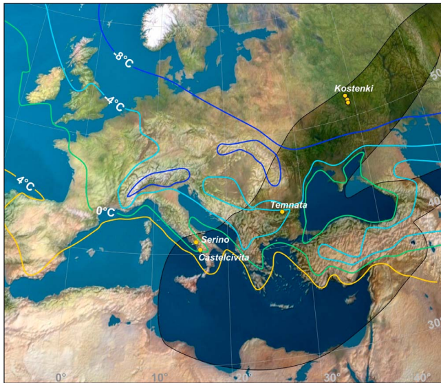
Figure 2. Distribution of the archeological sites containing CI tephra (yellow circles from Fedele et al. [2003] superimposed on a map showing the simulated mean winter temperature isolines in Europe during the relatively warm interstadial phase ( \sim 40 ka) before the CI eruption (modified from van Andel [2002]). The 0.5 cm isopach of the simulation CII73R is also highlighted as a shaded area.