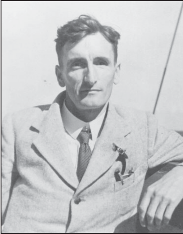
Figure 2. A photograph of Guy Stewart Callendar (1898–1964), taken in 1934. Additional photographs can be found in Fleming (2007).

Reanalysis (Compo et al. , 2011) continue to refine our estimates and understanding of historical climate variability.