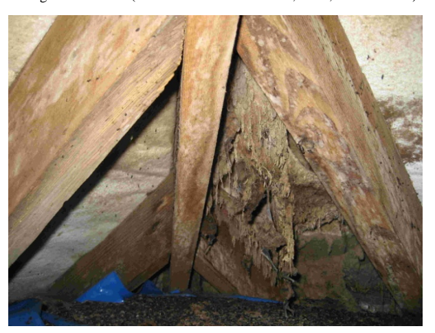
Fig.10. Damaged membrane in which 20 dead bats were found entangled