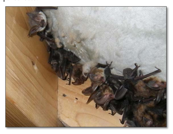
Fig.3. Picture of 'fluffing' on BRM six months after being fitted in a brown long-eared bat roost (Photo Credit - John Martin, 2012, Cumbria, UK)

Whilst industrial tests represent the stresses that BRMs may encounter within a normal roof space, they do not simulate the potential stresses the membrane may be exposed to in bat roosts. The problem with this is that neither test accounts for either the small scale of bats claws or the fact that they penetrate the SBPP fibres when gripping. This action may lead to bats grabbing the spun-bond fibres and teasing them apart. This then results in small clusters of fibres being pulled away from the main membrane which can be seen as a 'fluffing' on the surface of the BRM, which may pose an entanglement threat. Reports of bats found dead following entanglement are becoming increasingly common, as roosts where BRMs have been fitted are being re-visited. In some cases BRMs are showing signs of entanglement potential within months of the bats returning, after the BRM had been fitted. Figures 3 and 4 show 'fluffing' of two different membranes, both of which had been fitted in brown long-eared bat roosts only 6 months prior to the visits. In other scenarios BRMs are being removed from projects that were re-roofed up to 15 years ago and large numbers (between 12 and 104) of dead bats are being found tangled in filaments that have been pulled loose.