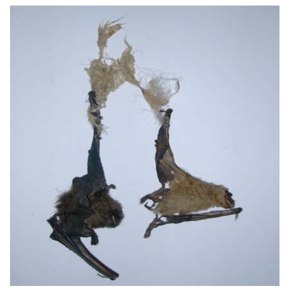
Fig.5. Two serotine bats found dead after becoming tangled in SBBP fibres pulled loose from a BRM

In some species, the calls of distressed bats may attract other bats from within the roost to the area of danger, and with such behaviour recorded (Dietz et al., 2009) this problem has the potential not to just affect individuals but larger numbers within the roost (Fig. 6).