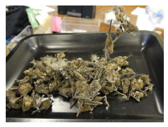
Fig.6. Large number of pipistrelle bats (104 were counted in total) found dead trapped in a BRM