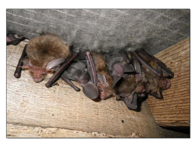
Fig.4. Picture of 'fluffing' on BRM six months after being fitted in a brown long-eared bat roost