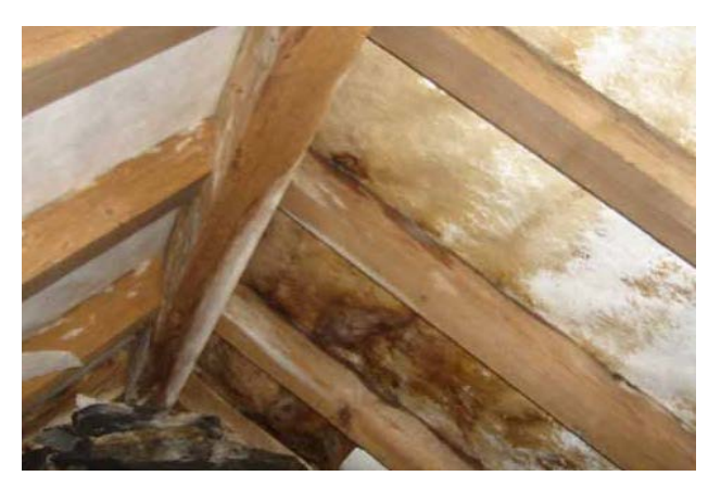
Fig.8. Staining of a BRM through absorption of excrement