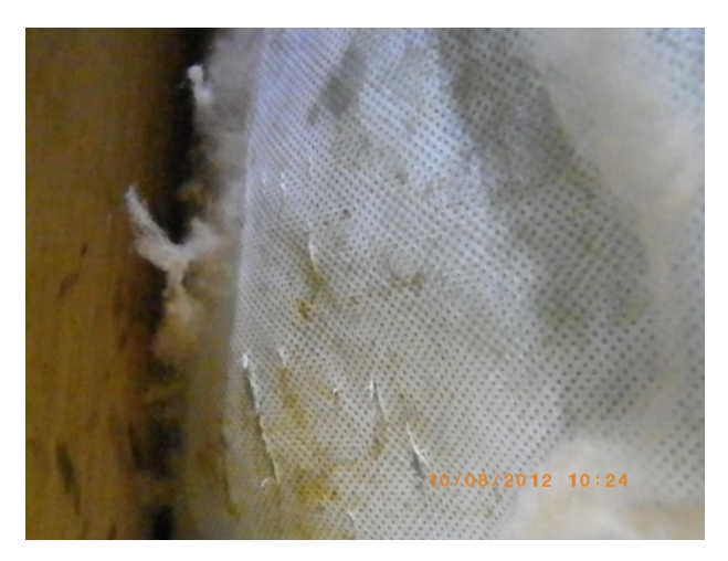
Fig.9. BRM showing damage to the functional layer six months after fitting in a bat roost