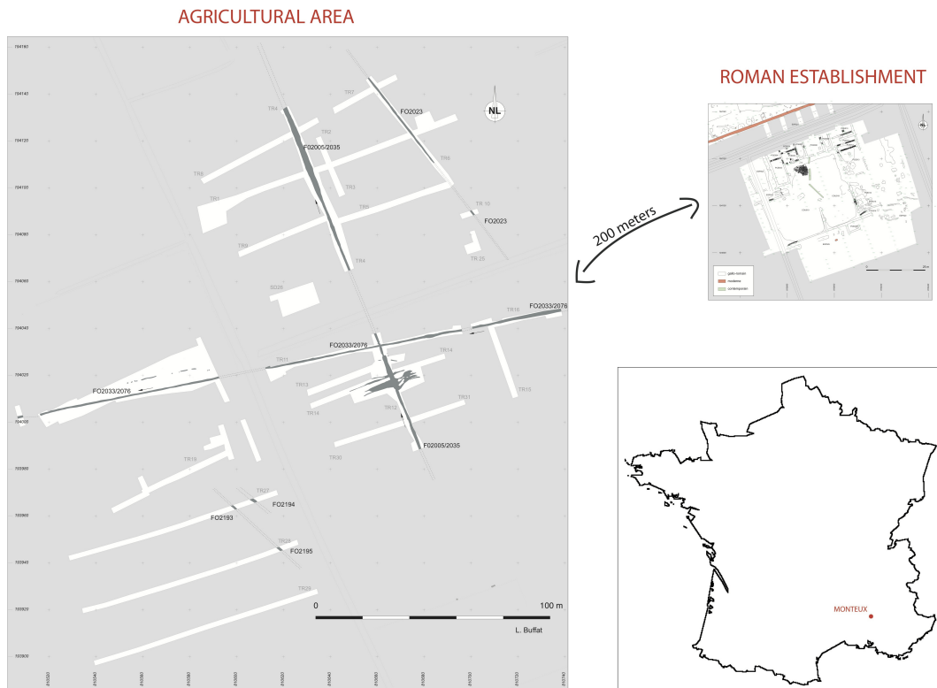
Fig. 1 | Site location and study area.

and included a ditch to evacuate water. In contrast to other settlements from the region dating to the same period, 4 we do not know if the water evacuated from the courtyard was used for irrigation; nevertheless the ditch was oriented towards the agricultural area.