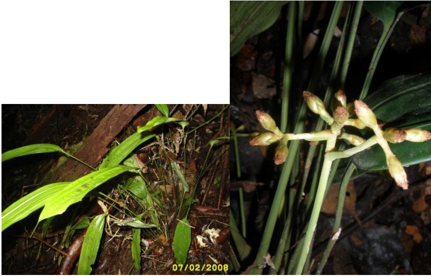
Fig. 2. Mapania multiflora . A whole plant; B inflorescence; C fruit; D type specimen. A , B , D photographed by Sekudan Tedong, C by Z Shabdin.