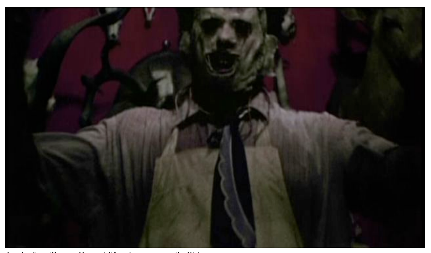
Leatherface (Gunnar Hansen) lifts a hammer to strike Kirk

In this revised critical approach, the interpretative emphasis in looking at Kirk's death is not on access, interiority or understanding the character, but on the striking contrast in the rapid changes between states of physicality. The film fully captures the determination and power of Vail's body as he runs down the hall, but closely follows this with a shot of him twitching helplessly on the floor. While we may have been distanced from him until this point in terms of epistemic access or a moral alignment, the swiftness of the switch from intruder to victim is deeply shocking. Vail's body performs the finality of Kirk's death most harrowingly, his twitching and kicking making the brutality of the act more emphatic. The body is the only point of engagement available to us, ensuring a physical response, an apprehension based almost simplistically on the dynamics of what is