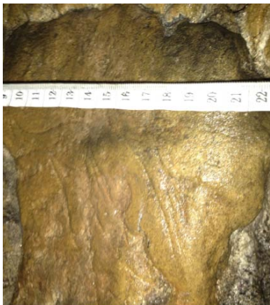
Fig. 1. Photograph of panel of bird etchings in Church Hole cave

In 2002, the first evidence of prehistoric cave art in Great Britain was discovered at Creswell Crags, on the Derbyshire-Nottinghamshire border [3]. Much of this art consists of etchings – patterns directly engraved into the rock using a sharp implement – which, unlike paintings, are difficult to recognize or see without a practiced eye. True prehistoric etchings can be distinguished from contemporary graffiti by the presence of a rock patina caused by prolonged weathering, exposure and precipitation, or by Uranium-series dating of the flow rock, i.e. layers of calcium precipitate deposits that overlie the art and magnesian limestone. The figures are estimated to be approximately 12k-15k years old.