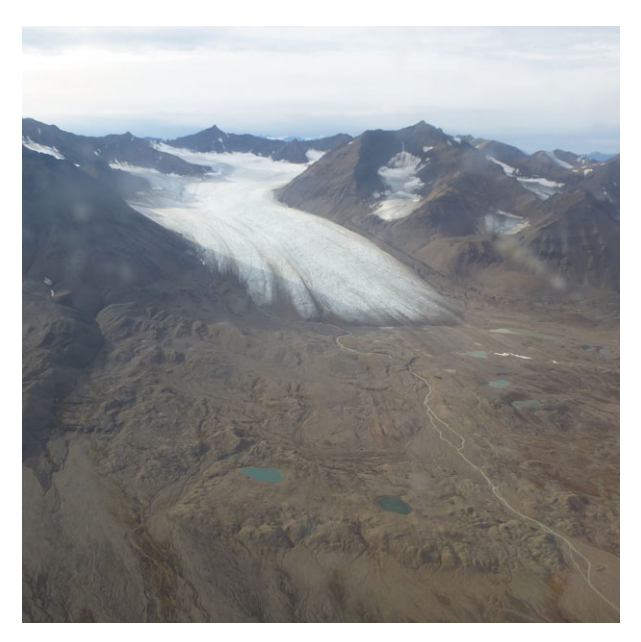
Figure 1. Aerial photograph of the forefield of Midtre Lovénbreen, a retreating valley glacier in Svalbard. For scaling purposes, the proglacial lakes vary between roughly 40-100 m in length.

method, taking a transect perpendicular to the snout of a receding glacier and using a space-for-time substitution, the development of recently exposed to established soils further from the ice-front can be characterized. This review covers the current body of work in deglaciated forefields in polar and alpine regions, and outlines suggestions for future research. Section 2 describes the major trends in the existing literature on forefield development, nutrient cycling and microbial communities. Section 3 considers the techniques employed in field studies to characterize soil microbial communities. Section 4 introduces the importance of seasonality of polar soils. Section 5 draws attention to model development and a greater understanding of the processes that dominate these ecosystems. Newly exposed glacier forefield ecosystems will become much more expansive with continued ice retreat in a warming climate. Hence it is imperative to understand and predict how these ecosystems will develop in the future.