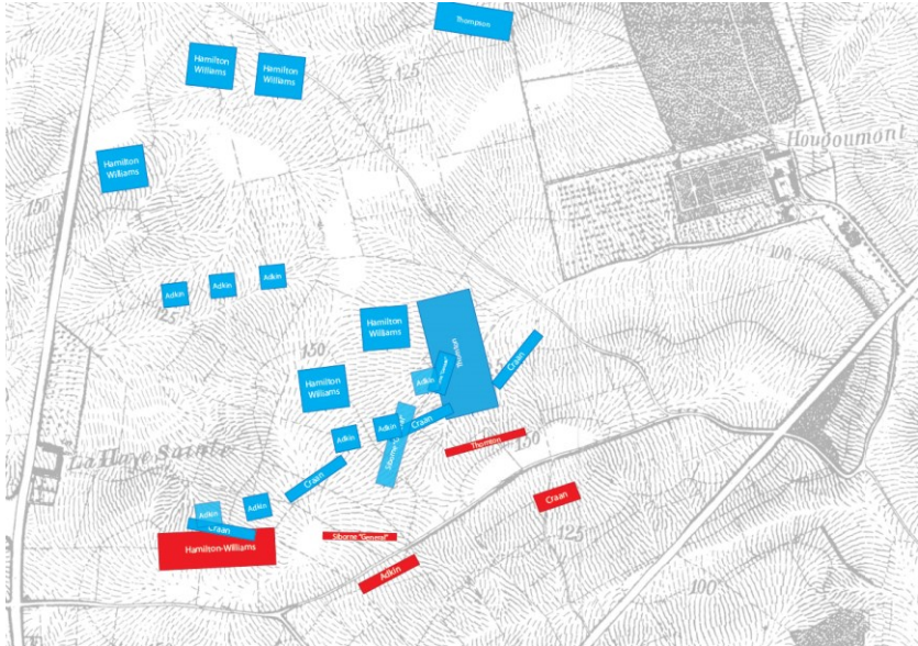
Figure 1: Locations and unit sizes of the 3/1 st Foot Guards and Imperial Guard from different authors plotted on Siborne's map.

from those same maps. It is possible to see the wide variation not only in location but in size and direction of movement (see Figure 1).