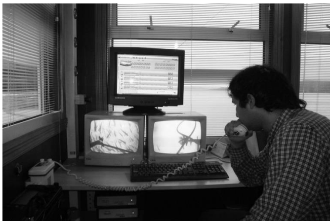
Figure 1: Worker monitoring salmon movement

Data from our ethnographic research on salmon farming in Chilean Patagonia highlights inter-subjectivities that emerge between people and salmon as part of a process of bio-power creation that we would argue has become integral to regional transformation. Across the region, technologically intensive offshore pontoons incorporate sophisticated devices for ensuring the development of salmon of a quality appropriate to global markets. Each Pontoon is a floating three-storey structure, incorporating a watchtower, offices with ICT equipment, living quarters, and storage areas surrounded by in-sea net-pens. Fish feeding is controlled by software; with fish movements followed by submarine camera. Workers have a finely honed ability to interpret the fish behaviour they witness on screen (Figure 1), being able to tell when they are ill, hungry, nervous, overfed, with slow metabolism, etc.