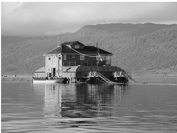
Figure 5: Fish farming pontoon

As we neared the pontoons, spots of light showed on the dark horizon, and as we drew close we observed a house-like 3 storey structure full of windows, which look out onto the fish platforms that extend into the ocean (Figures 5 – 6).