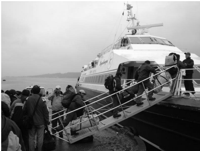
Figure 4: Fish farm workers on their daily way to work

At Melinka, GrandSalmon uses technologically intensive pontoons to farm the salmon. The following ethnographic data is based on a trip to a pontoon: A high speed catamaran, the Sognekongen, belonging to a Norwegian company showed up at the embarkation point and salmon workers quickly gather, identifiable in waterproof jackets carrying life vests (Figure 4). After three hours of pitching and rolling, the catamaran approached the isolated village of Melinka – a settlement that flourished in the nineteenth century for the timber trade, now witnessing a salmon boom.