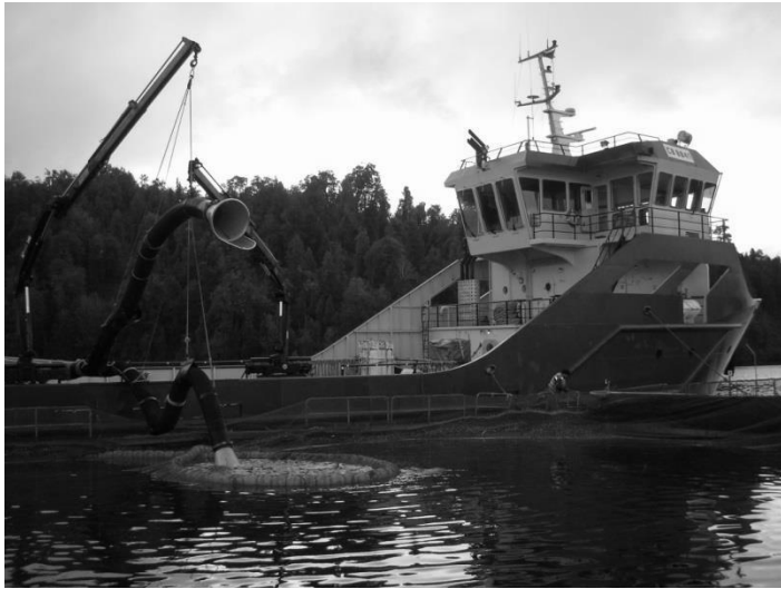
Figure 3: Well-boat harvesting fish in the Puyuhuapi ford.

system. 10 Using his father's shipyard, Mr Ross adapted a vessel for use as a well-boat, its success led to the creation of 'South Pacific Well-boats', equipping boats with the latest technology.