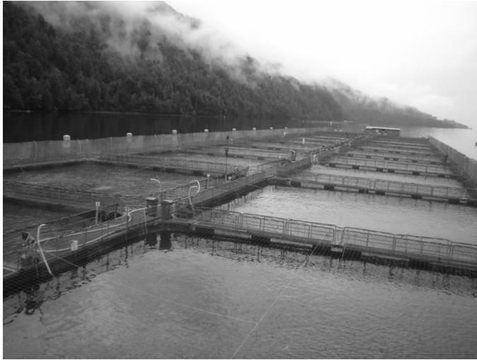
Figure 6: Fish farm

At the pontoon the main routine tasks of the staff are controlling the right level of inputs needed for keeping fish production going: fuelling oil to the generators, fish meal to the blower's tank and butane cylinders onto the motorboat, watching the submarine cameras to control fish feeding behaviour and adjust the software if necessary. In addition, a foreman is responsible for people's needs, and for supplies, keeping inventory records, sending reports to headquarters, and overseeing contracted services. Each day workers are left on the fish platforms with staff moving between platforms and pontoons by motorboat, intercommunicating by walkie talkies. With automatic feeding, routine tasks include supervising the function of blowers, checking fish behaviour and receiving a daily team of divers to extract dead fish and conduct maintenance.