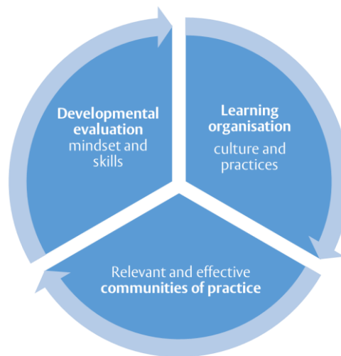
Figure 2: The virtuous circle connecting developmental evaluation, learning organization principles and effective CoPs

Although developmental evaluation theory argues that this kind of evaluation is most relevant in the early innovative stages of change initiatives, viewing the organization as a complex knowledge environment (McKenzie and van Winkelen, 2004) suggests the relevance of these principles over the longer term due to the inevitability of ongoing adaptation and change.