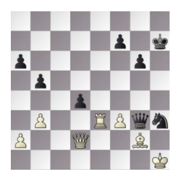
Figure 3. R3: a) RAPTOR – JONNY 18w, b) KOMODO – HIARCS 27w and c) GRIDGINKGO – SHREDDER 46b.

KOMODO – HIARCS was a game between two tough opponents. Both programs have excellent pedigree and a clash of ideas was expected. The game started smoothly with an English opening and for a long time the main motif of the game was not clear. However on move 27 White played f4-f5 , see Figure 3b, which opened the possibility of a king walk into Black's position. This dominant feature decided the game. The continuation as followed by Black underlines the idea and we see that penetration is more important than capturing a pawn. The way White completed the game deserves applause.