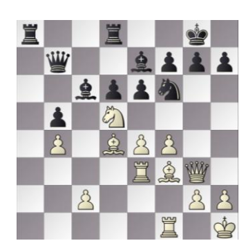
Figure 10. R10: a) JONNY – KOMODO 24w, b) RAPTOR – GRIDGINKGO 36w and c) HIARCS – SHREDDER 23b.

The game RAPTOR – GRIDGINKGO was a clear last round game. The computers had done their utmost during the tournament and now it was time for a fast game with not so many complications. Playing quickly and exchanging all that was possible without looking for complications was the order of the day. The result was a draw as in Figure 10b which left both players happy.