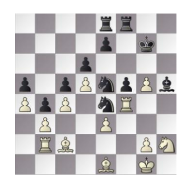
Figure 1. R6: a) JONNY – HIARCS 33b, b) SHREDDER – RAPTOR 22w and c) GRIDGINKGO – KOMODO 41b.

SHREDDER saw its opponent playing the Kings Indian. It is one of the most difficult openings in chess. RAPTOR playing Black reached a normal midgame with Kings Indian characteristics. In that situation the real fight began. White was forced to play its rook up the d-file. The program did so with a nice combination. It gained the small exchange in return for two pawns, see Figure 6b before g2-g4. Moreover White's evaluation of the resulting position was superior. The pawns did not have any impact whereas the two pieces were superior to the rook. SHREDDER outplayed RAPTOR in this phase and brought the full point home.