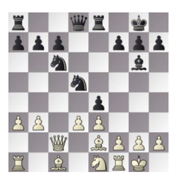
Figure 9. R9: a) SHREDDER-JONNY 31w, b) GRIDGINKGO-HIARCS 106b and c) KOMODO-RAPTOR 16b.

GRIDGINKGO – HIARCS was a fascinating game for the players, and for the spectators it is an exercise in playing the complete sequence of moves. For more than one hundred moves the players showed that they have equal strength. Of course many small details can be highlighted but while the finer details may be of interest to programmers, they may not be to the general public. The game started equal and finished in the deadlocked draw of Figure 9b, a well deserved result for both sides.