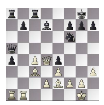
Figure 7. R7: a) GRIDGINKGO – JONNY 51b, KOMODO – SHREDDER 44w and c) RAPTOR – HIARCS 24b.

KOMODO – SHREDDER started as a real fight with Sicilian flavor. By a move to move evaluation it might be possible to find some evaluations departing from zero. The general impression for readers is however that this game is one of equal forces. It was good to see both sides trying to achieve some advantage but the opponents turned out to be of equal strength. Still Black seem to manage a slight advantage by a more harmonious structure and a good consolidation of what had been achieved. White must have noticed this also and decided to take an exit that led to a draw. In did so by a rook sacrifice, see Figure 7b, followed by a perpetual check.