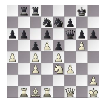
Figure 1. R1: a) HIARCS – JONNY 22w, b) RAPTOR – SHREDDER 21b and c) KOMODO – GRIDGINKGO 25b.