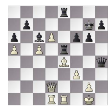
Figure 2. R2: a) JONNY – GRIDGINKGO 47b, b) SHREDDER – KOMODO 44b and c) HIARCS – RAPTOR 35w.

The game Shredder - Komodo started as a Gruenfeld, Schlechter variation. Both sides played the opening along the usual lines. Shredder gained a pawn and tried to keep that pawn as an asset for a win in the far future. White was even able to run with the passed b-pawn along the b-file. The only possibility for Black was a counter attack on the queenside. The attack was not really furious but Black was able to exchange many pawns on that side of the board. The limited number of pieces led to a very interesting endgame. White was still a pawn up; Black had the advantage of mobile pieces. The activity of the black pieces guaranteed sufficient counterplay. When White tried too hard it compromised its position, see Figure 2b. However the material advantage was not enough for Black to win. The result was that bishop plus pawn against bishop plus bishop ended in a draw.