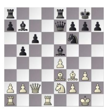
Figure 5. R5: a) KOMODO – JONNY 45b, b) GRIDGINKGO – RAPTOR 14w and c) SHREDDER – HIARCS 18b.

In the game GRIDGINKGO – RAPTOR the opening was strategic and the game was equal for a long time. Black pushed for a decision on White's centre. GRIDGINKGO took the unusual step of giving up its direct influence on the centre by capturing on c5. Now a subtle exchange of strategies took place. Black did not recapture but used the pawn to attempt to increase the tension on that part of the board, see Figure 5b. Superficially it looked alright because Black had rather good compensation. Nevertheless White found ways to keep the pawn, recover the position and enable some exchanges. The more exchanges occurred on the board, the more valuable the advantage of the pawn became. Finally it was the key to the white win.