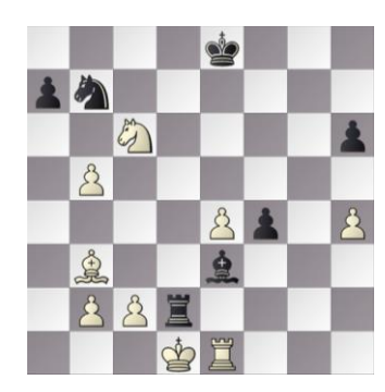
Figure 4. R4: a) JONNY – SHREDDER 31b, b) HIARCS – GRIDGINKGO 44b and c) RAPTOR – KOMODO 31w.

The game RAPTOR – KOMODO started full of expectations as the Staunton Gambit was played. Both sides followed the theoretical line which is known to lead to equal play. Both programs knew the strategic lines to be followed but as we all know, the challenge of chess is in its subtleties. Black tried to outclass White in a tactical way. However White took the pawns offered and decided to defend as best it could. As White did well, Black decided to look for a repetition and found it on move 30, see Figure 4c, by forcing a direct repetition of moves for a draw.