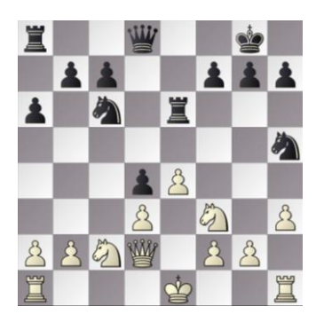
Figure 11. PO: a) 1.1 KOMODO – JONNY 53b, b) 1.2 JONNY – KOMODO 28w and c) 3.2 KOMODO – JONNY 17w.

The second game also had a surprise for the spectators as on move 28 White sacrificed the exchange, see Figure 11b. JONNY captured an additional pawn and that was all. In fact, JONNY had a rook, two bishops and a pawn. That is usually considered as a weaker material force than two rooks and one bishop. However in the game it turned out to be of equal value. Later on Black felt forced to return the material after which an equal position resulted and a draw was agreed.