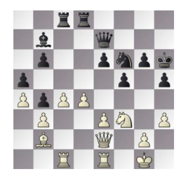
Figure 8. R8: a) JONNY-RAPTOR 16w, b) HIARCS-KOMODO 80w and c) SHREDDER-GRIDGINKGO 27w.

HIARCS – KOMODO was an old-style Caro-Kann game. Having seen the whole game it is perhaps best to call it the game of double pawns and triple pawns. It started in the opening when White took the knight on a6 with its bishop. Black tried to take the initiative and looked for a weak spot in the white position. There were two or three such spots but they were unreachable. This implied that the fight was quiet balanced. At one moment Black seemed to be in the lead but White managed to annihilate all threats. This pattern of Black attempting to find weak spots and White defending all the spots continued up to the end of the game. There, a fascinating finish was prepared. After 79. ... Qd2+, see Figure 8b, White made the wrong choice. It should have played 80. Kf1