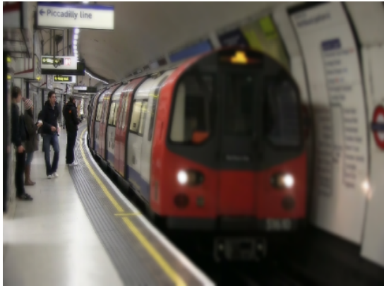
Figure 7. Hyperopia preset