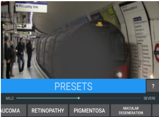
Figure 1. Presets menu.