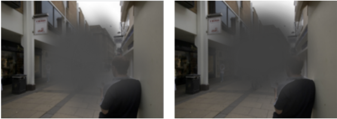
Figure 13. Macular degeneration comparison Cambridge (left) and VISAD (right)