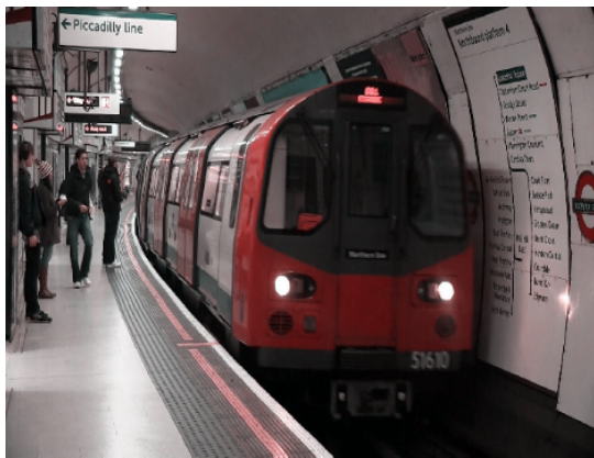
Figure 9. Colour blindness preset