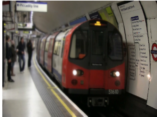
Figure 8. Myopia preset