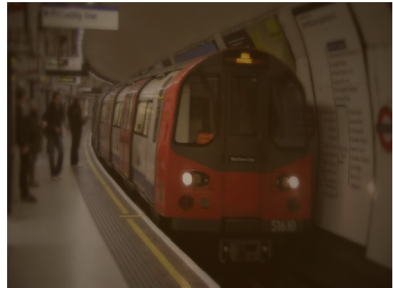
Figure 2. Cataract preset.