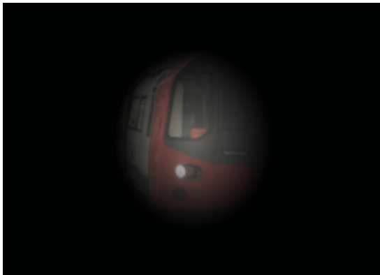
Figure 3. Glaucoma preset