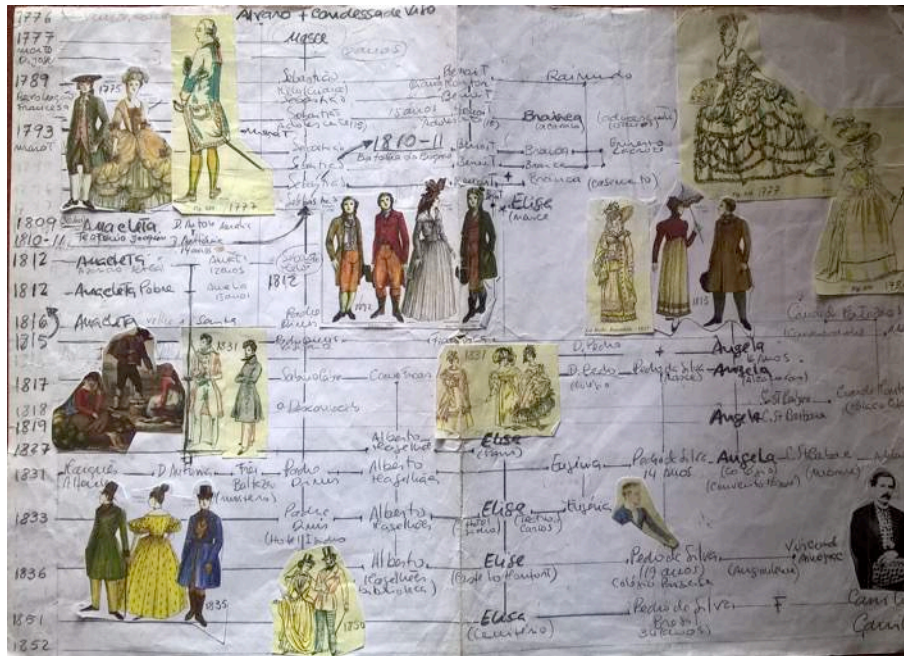
Figure 1: Art director Isabel Branco’s map and timeline of Mysteries of Lisbon (© Isabel Branco)

perfectly illustrates the dialectics informing the film’s aesthetic organisation as a whole. Its purpose seems to be to decompose the medium into the elements involved in its making, creating intermedial and historical passages that cast suspicion upon the film’s linear, finite storytelling.