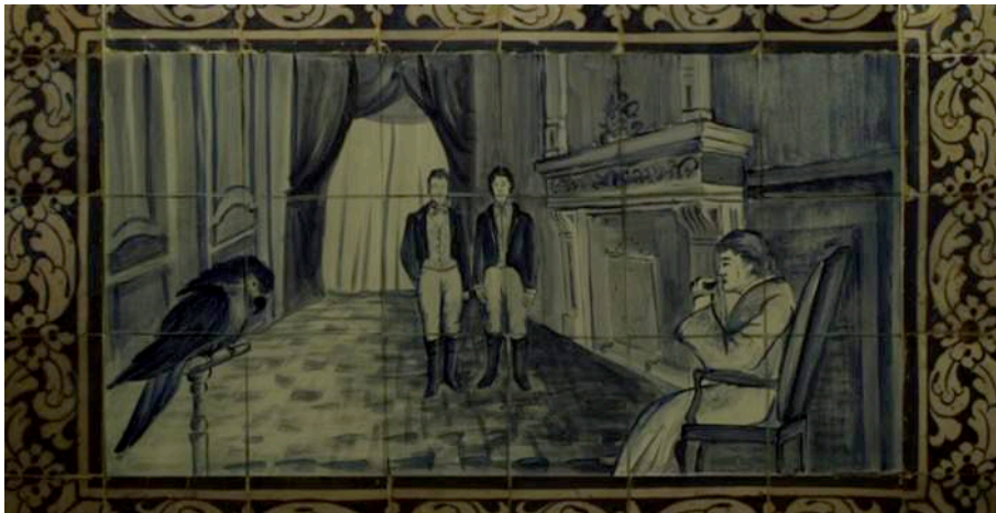
Figure 2: The fake azulejos that introduce Mysteries of Lisbon .

ascension of the merchant bourgeoisie. The scene's protagonist is the aforementioned Alberto de Magalhães, who summarily dismisses the seconds of nobleman Dom Martinho de Almeida sent in to challenge him to an honour duel, a ritual turned meaningless for this representative of the ascending merchant class. Curiously, the three human characters are pushed to the background by the magnified presence of the blue-and-yellow macaw in the foreground. This piece of undisguised, uncontrollable living reality is a wonderful, heart-wrenching end result of the previous intermedial and historical passages. A bird typical of Brazil (a former Portuguese colony) and now an endangered species, the macaw squawks painfully from time to time as if to remind us of its captive condition. Though placed seamlessly within the narrative flow, the way this scene is preceded by the azulejos and the toy theatre draws attention to the many artforms at the base of the film medium and the various eras contained in the present moment. Most notably, the magnified macaw, whose squawks distract the attention of one of the standing men, opens up for, and gives prevalence to, chance events, whose capture is an exclusive indexical property of recording media such as film.