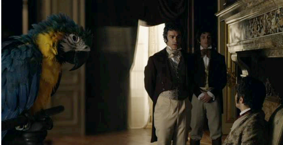
Figure 4: Finally the characters come to life.

Waldo Rojas (2004, 14), a prominent Chilean poet and Ruiz's close collaborator, states that: