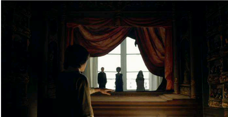
Figure 5: Characters are turned into cardboard miniatures in order to enable spectatorial participation.

Ágnes Pethő (2009, 50) observes, about the intermedial procedures in The Gleaners and I ( Les Glaneurs et la glaneuse , Agnès Varda, 2000), that: