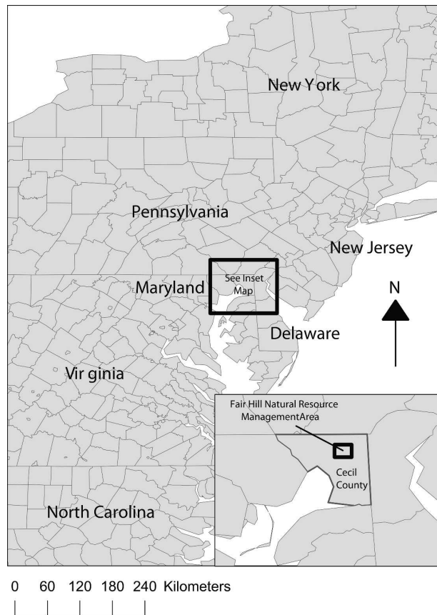
FIG. 1. A map showing the location of Fair Hill Natural Resource Management Area in the context of the mid-Atlantic United States.

Summer is the wettest season (324.1 mm total for June, July, and August) and winter the driest (274.1 mm for December, January, and February). Snowfall occurs almost exclusively in winter, and the annual total (350.5-mm depth on average) is often dominated by only a few storms. The mean January (July) air temperature is -0.6^{\circ}\text{C} ( 24.6^{\circ}\text{C} ). The growing season averages 191 days in April through October.