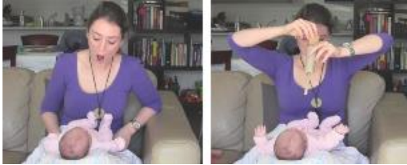
Figure 2 In the Oostenbroek et al. procedure, infants were balanced on the experimenter’s lap leading to poor postural control (Photos from: Kennedy-Costantini, Slaughter, Nielsen, 2016.)