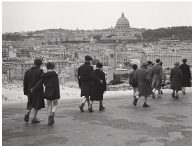
Figure 1: The final shot of Roberto Rossellini's Rome Open City .

Rome Open City 's ending to be inherently—indeed deliberately—ambiguous. 3 My interpretive wager, however, is that it is possible to adjudicate between the competing critical camps and to arrive at a more persuasive—not to say definitive—analysis of the film's final shot. It is thus my aim in this brief essay to explore several conjectures that, if I am correct, may yield new insights into the implications and connotations of the conclusion to Rossellini's post-war masterpiece. Since that masterpiece has often been made to serve not just as an expression but also as a virtual embodiment of its historical moment, and has even been credited with changing the course of Italian history, the search for new insights into its conclusion takes on added importance. 4