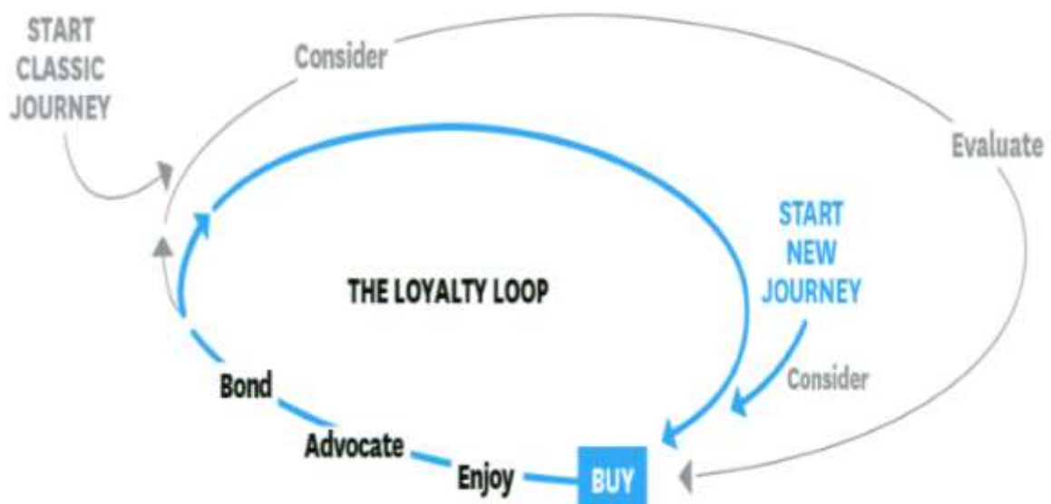
Figure 1. Streamlining the decision journey

Traditionally, the journey has involved consumers considering and evaluating before deciding to buy, and then making a decision either to enter a loyalty loop and buy again or to go through the same process but purchase a different brand from elsewhere. Edelman & Singer (2015) highlight a progressive approach whereby a new journey is streamlined by compressing the ‘consider’ step and dramatically shortening or eliminating the ‘evaluation’ step, by directing customers straight into the loyalty loop for a brand and then keeping them within that loop (see Figure 1); and many organizations are now optimizing the customer experience through various triggers and touch points along the way. Purchasers of the Apple brand is a good example of this, whereby consumers are engaged, become hooked and continuously enjoy, advocate, bond with and benefit from the brand.