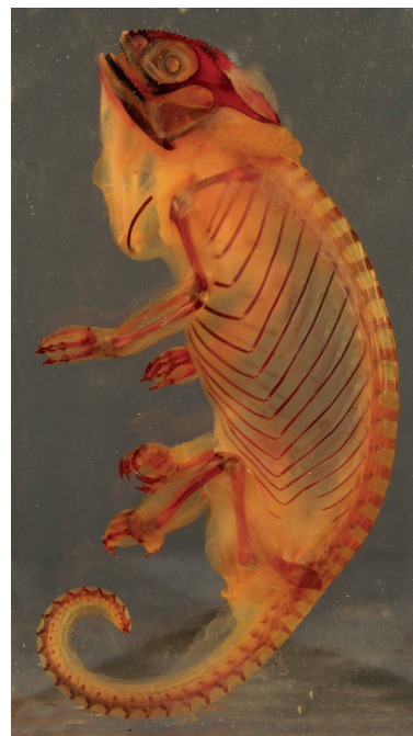
Figure 5. Chameleon preparation REDCZ-COLE2962.