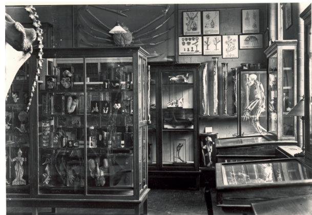
Figure 6. The Cole Museum at the London Road site.

The Museum was originally based on the London Road campus of the University (Figure 6). After Cole's retirement in 1939, space was an issue. After a delay due to the outbreak of World War II, a new zoology building was completed at the London Road site, with basements that could double as air-raid shelters. The aforementioned 1956 Nature article on Professor Cole and his Museum noted that the Museum was housed in an inadequate building, stating that " it is greatly to be hoped that on the new University site... " (the Whiteknights campus purchased in 1946) " ...a worthy building will be planned ", and also that the University would make sure that it maintained " what is a unique asset, not only for the University of Reading, but also for the entire country " (Anon., 1956).