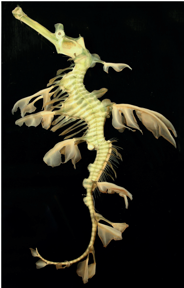
Figure 4. The leafy sea dragon Phycodurus eques (Günther, 1865) REDCZ-COLE3206.

it was when I set eyes on it for the very first time more than 40 or so years ago " (Cowper, 2007). (Figure 4).