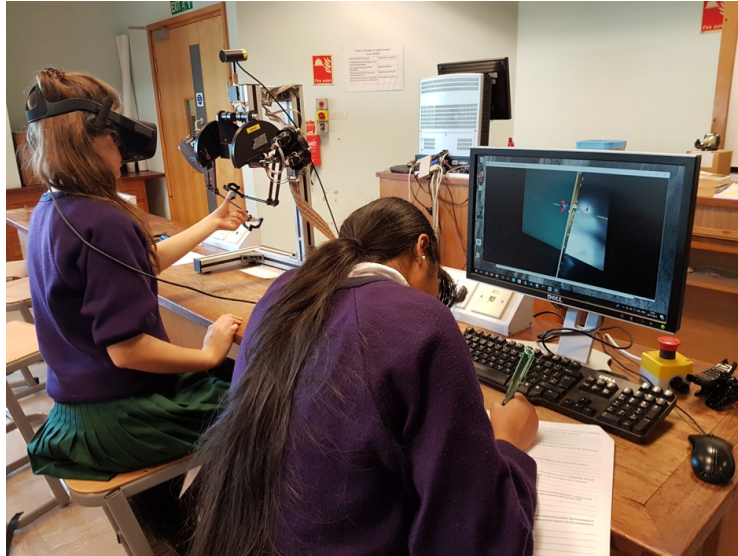
Fig. 1. The multi-finger haptic interface used by the pilot while the co-pilot is working on the worksheet. The device is controlled by a single hand where the fingers of the user (thumb and index fingers) are attached to the robots by a thimble.

One of the mechanical design challenges of the haptic interface is achieving a flexible solution for attaching various sizes of fingers to the robots of the haptic interface. This problem becomes significant as the target group in the experiments is boys and girls of age around 12 who have a wide range of finger and thumb diameters. The thimble design is used in Fig. 1 to attach the student's finger to the haptic interface. This design provides flexibility for a wide range of finger sizes and aims to ensure that the finger is firmly attached while not being uncomfortable to the user.