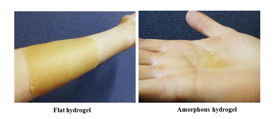
Figure 2. Flat and amorphous hydrogel products for wound care.