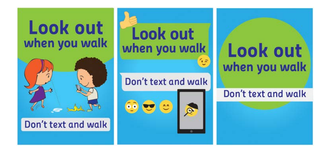
Figure 2: Posters used in the study to test different approaches to pictorial information (size A4). From left to right, Poster 1 - informative pictorial information, Poster 2 - decorative pictorial information, Poster 3 - no pictorial information.

Three posters were designed with features that had been identified as typical in the analysis of H&S information for children; for example, bright colors, sans-serif fonts, depiction of children, synoptic images presented as drawings rather than photographs ( figure 2 ). Variants were designed, with the same verbal information and colors, but different pictorial information: Poster 1 had an informative picture, Poster 2 a decorative picture, and, the control, Poster 3 had no picture.