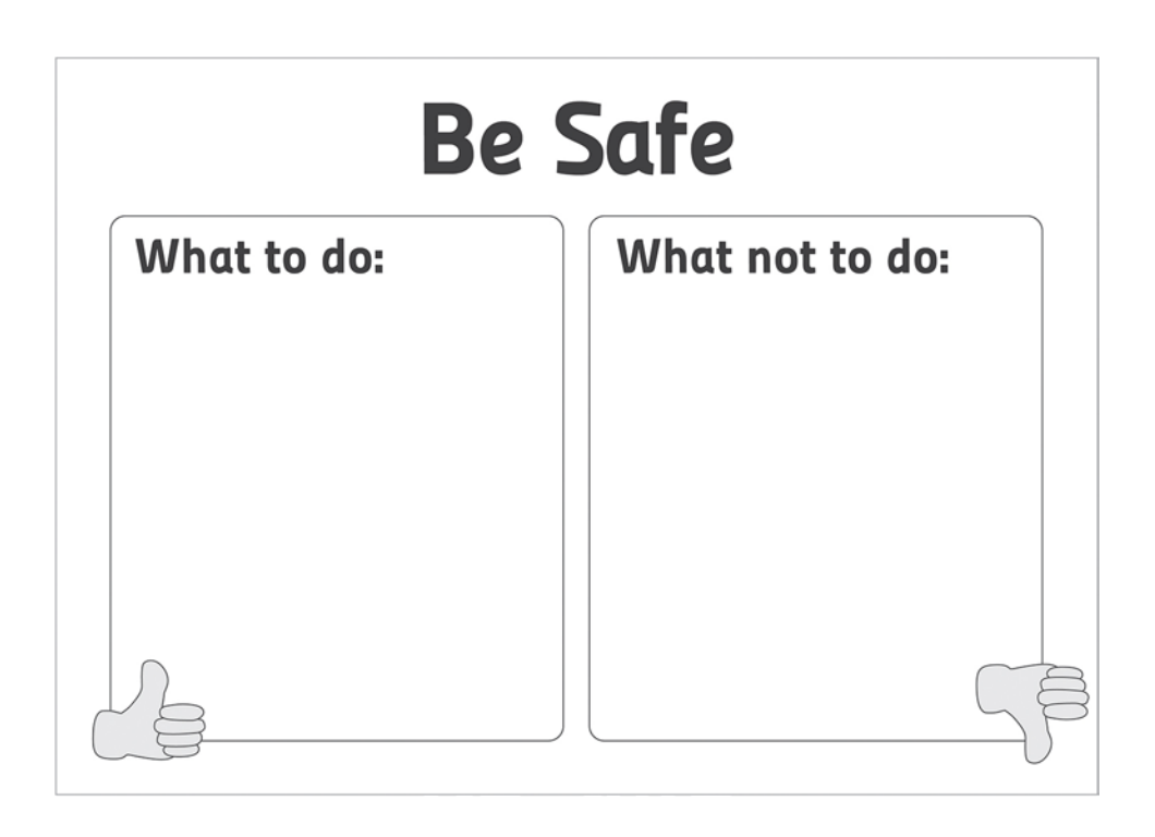
Figure 3: Be Safe list (size A4) distributed to children to make lists of dos and don'ts to be safe in daily activities.