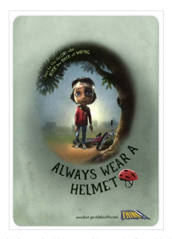
Figure 1: Example of H&S poster for children, part of the campaign 'Tales of the Road', size A4 (297 x 210 mm), aimed at 6 to 11 year-olds.

children, gathered from a range of UK and international sources (see, for example, DfT's 'Tales of the road' campaign in Figure 1), we found that posters are, typically, illustrated and tend to be targeted at broad age groups. For example the 'Tales of the road' campaign targets children aged 6 to 11.