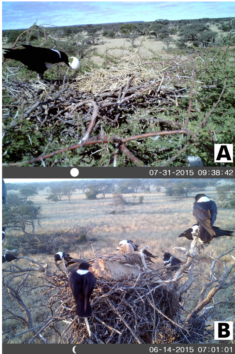
(A) A Pied crow eating an abandoned White-backed vulture egg. Egg abandoned 5 days prior to predation. (B) Eight Pied crows mobbing a nesting White-backed vulture. Nest was later abandoned by parent birds and the egg was then predated by Pied crows.