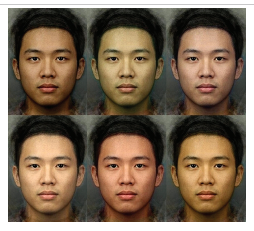
FIGURE 1 CIELab color transformation of a face with decreased (top) and increased (bottom) lightness (L*, left); redness (a*, middle); and yellowness (b*, right). Presented face is a composite for illustration purposes, but photographs of real individuals were used as the stimuli.