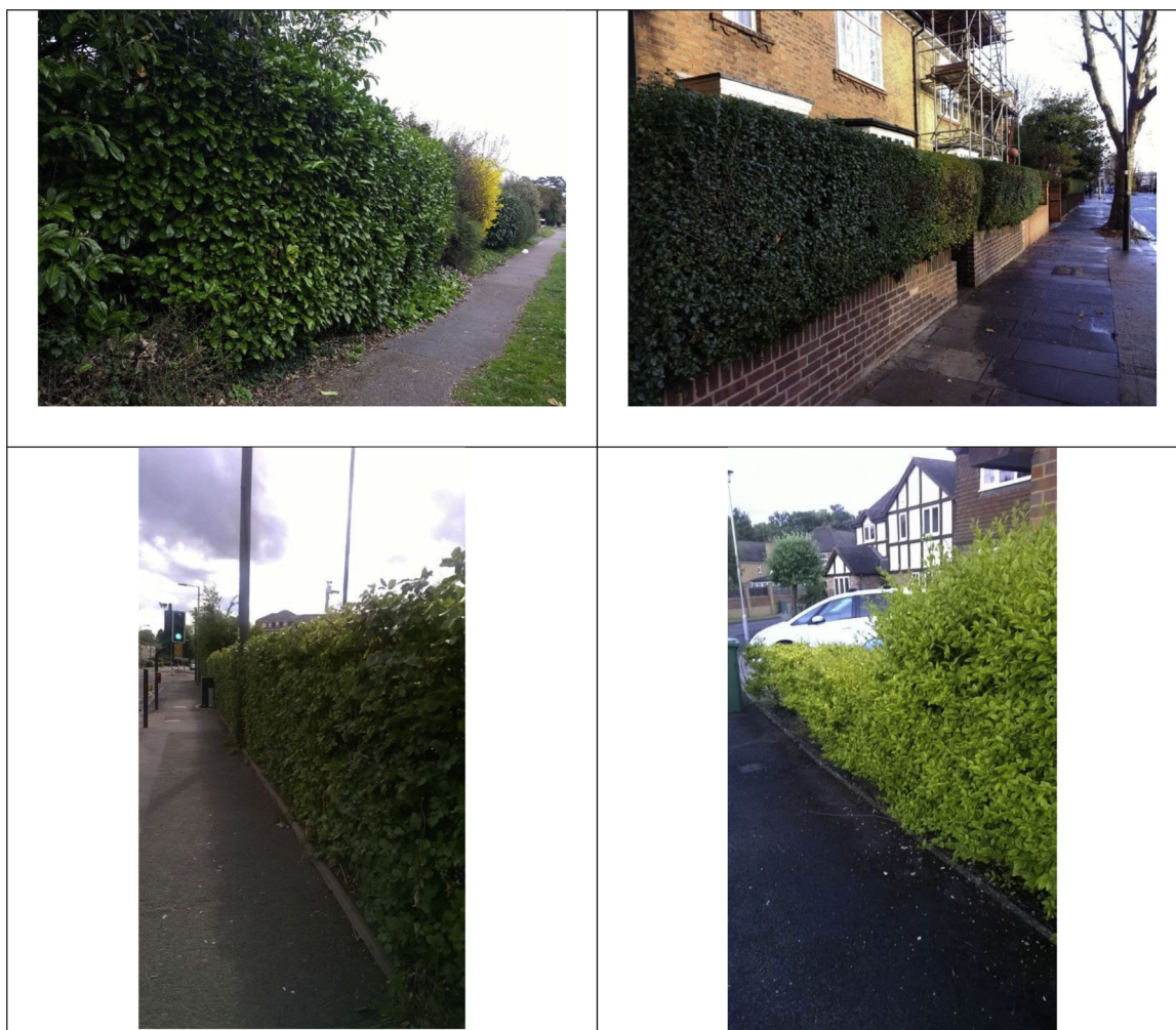
Fig. 1. Examples of hedges in various urban and suburban scenarios, creating a boundary between a street and a property.

insight of what is present in UK gardens). These species, encouragingly, included all the ones already identified in the nursery catalogues. We checked that these 25 taxa were commonly used in the landscape plant trade by contacting two further nurseries and two landscape contractors (who wish to remain anonymous), who verified these plants were ubiquitous as hedging material. However, a number of additional taxa (18) were additionally mentioned by these professionals as being widely used / becoming more popular as hedge plants and these were added to the shortlist for evaluation.