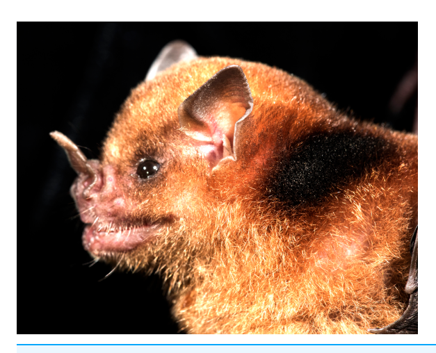
Figure 1 Sturnira parvidens adult male showing dark staining of fur surrounding the shoulder gland. Full-size ☑ DOI: 10.7717/peerj.7734/fig-1

development of these glands appears to be dependent on the reproductive maturity of the individual ( Scully, Fenton & Saleuddin, 2000 ). In mature males they are described as emitting a 'strong, sweetish, musky odour' ( Gannon, Willig & Knox Jones, 1989 ; Goodwin & Greenhall, 1961 ) that can be so strong it is detectable by humans several metres away (E Clare, 2016, personal observation).