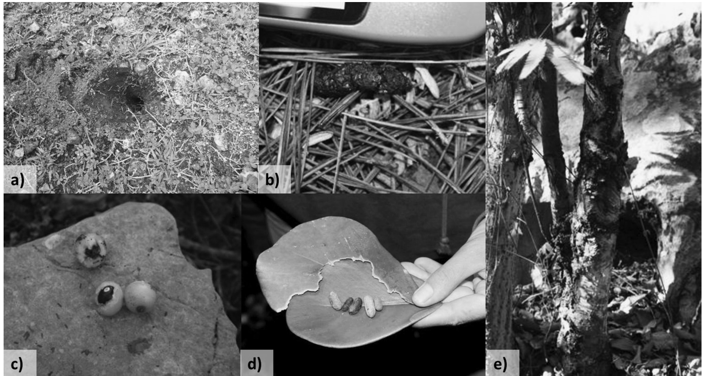
Fig. 2. —Hispaniolan solenodon ( Solenodon paradoxus ) field signs: a) conical-shaped foraging “nose-pokes”; b) feces. Hispaniolan hutia ( Plagiodontia aedium ) field signs: c) gnawed fruit; d) chewed leaf and fecal pellets; e) gnawed bark on tree trunk.

hutia is semiariboreal, and no urine marks were detected during surveys. Indirect signs of any age were used to confirm presence of species within survey plots, as the aim of the study was to understand presence of native mammals in different landscapes rather than fine-scale temporal habitat or resource use. Evidence of non-native mammal species was not recorded systematically.