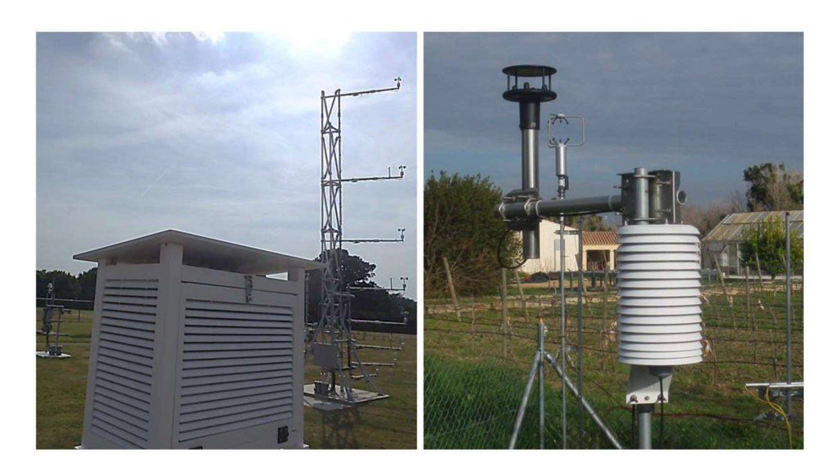
Figure 1. Thermometer screens. ( Left ) Stevenson-type screen at the Reading University Atmospheric Observatory. ( Right ) Beehive screen at the meteorological site of the Universitat de les Illes Balears, Palma. Both sites also have nearby wind measurements.

hinged door to read the thermometer opens on the shady side. In the widely adopted thermometer screen originally designed by the lighthouse engineer Thomas Stevenson (1818-1887, and father of Robert Louis Stevenson), double-louvred slats are used to form the sides of the screen, to maximise thermal contact with the air passing through. Smaller cylindrical "beehive" screens based on the same principle containing smaller electronic sensors are now also widely used (Figure 1).