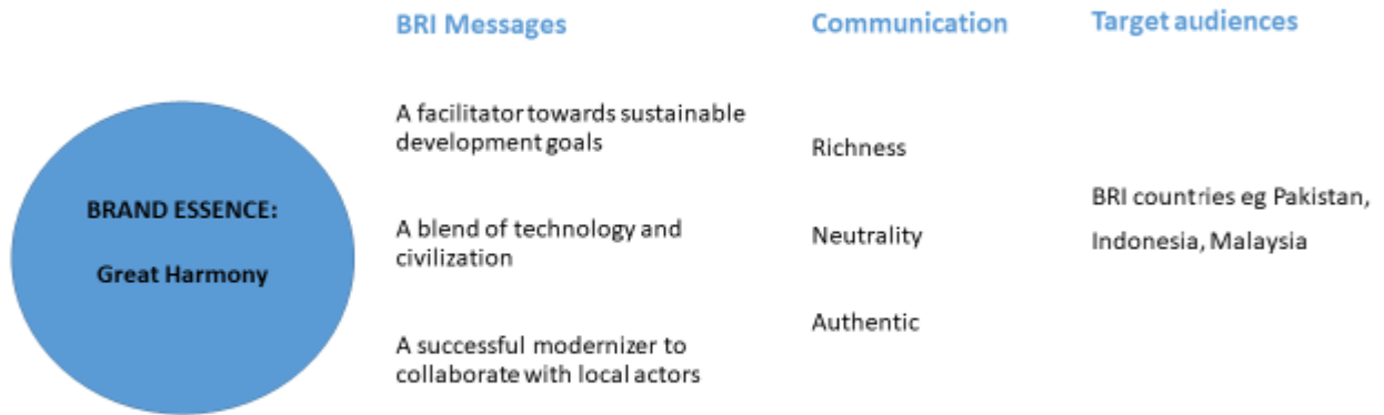
Figure 3: Nation Branding for the BRI