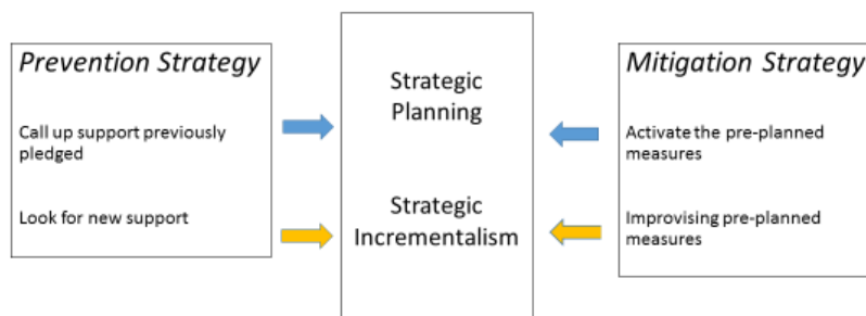
Figure 2: Strategic Approach for Managing Political Risk

differentiates the management of political risk before and after MNEs' commitment to a host country and suggests a typology of responsive actions. From a managerial perspective, the prevention and mitigation strategy available to firms in tackling political risks are further underlined by a planned yet incremental approach as summarized in Figure 2. This means that an approach that build on strategic planning, which could subsequently be adapted to changing environment could be the basis for a nation branding model.