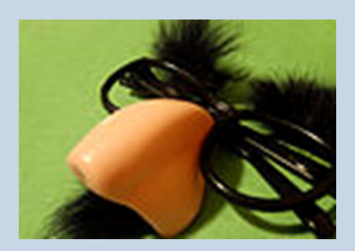
Fig. 1