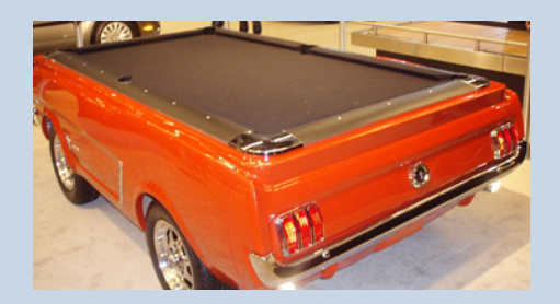
Fig. 3