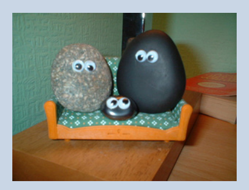
Fig. 2