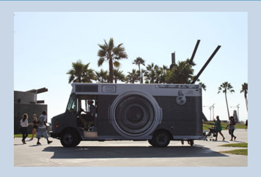
Fig. 4

While there are no right or wrong answers, arguably Figures 3 and 4 are more 'creative' in that as well as being 'original', they also have functionality as a pool table and a lorry respectively. The other two images do not really go beyond originality.